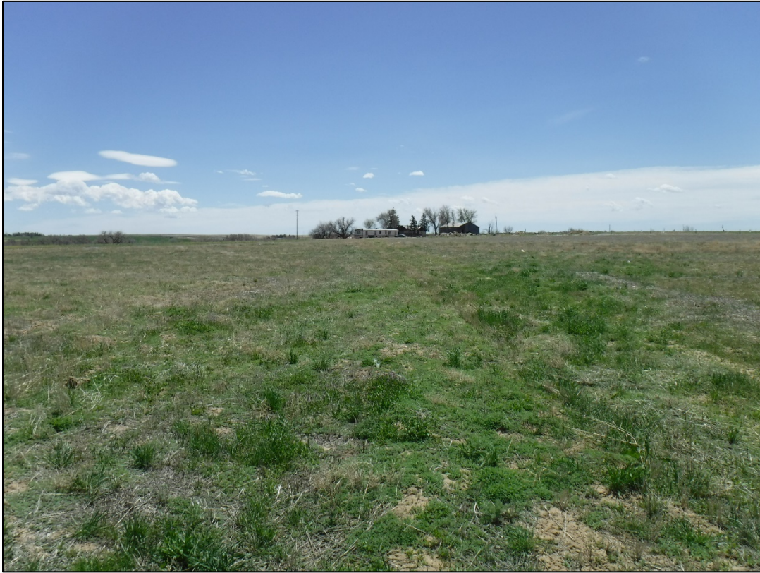
Photo 5: Typical new season growth from the middle of the southern parcel looking south, M2019-030