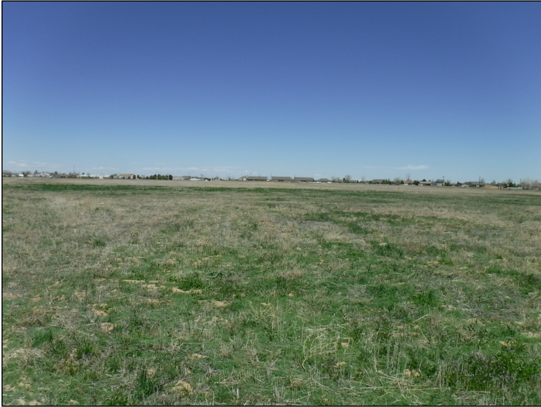
Photo 3: Typical new season growth from the middle of the southern parcel looking west, M2019-030