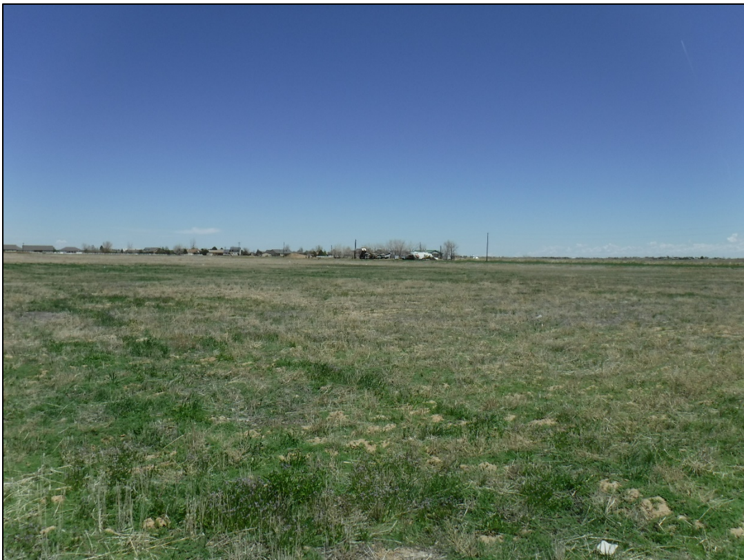
Photo 4: Typical new season growth from the middle of the southern parcel looking northeast, M2019-030