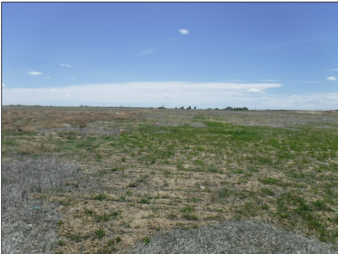
Photo 2: Typical new season growth on the southern parcel looking east, M2019-030