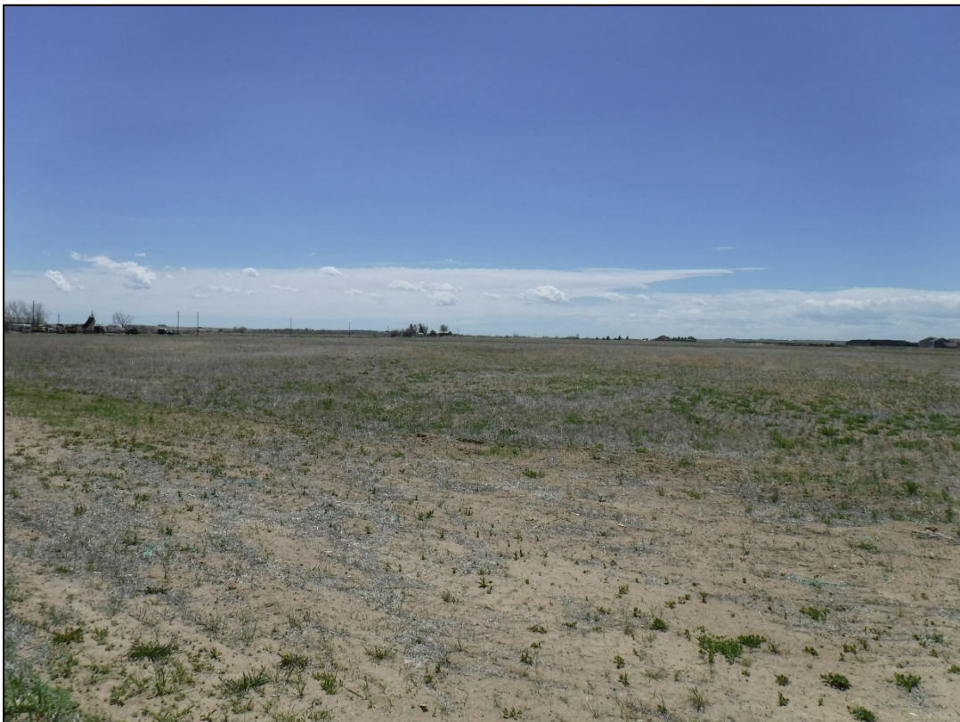
Photo 6: Typical growth on the north parcel, M2019-029, note gaps in vegetation