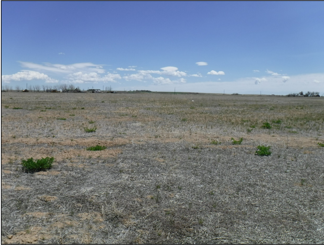
Photo 7: Typical growth on the north parcel, M2019-029, looking southeast, note gaps in vegetation