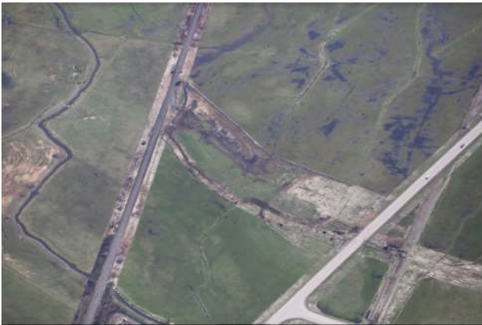
Photo above shown reclamation area, irrigation channels and surrounding flood irrigated fields. Walker ditch is on the left, tracks middle left, Hwy 40 Middle/middle right.

Number of Partial Inspection this Fiscal Year: 7