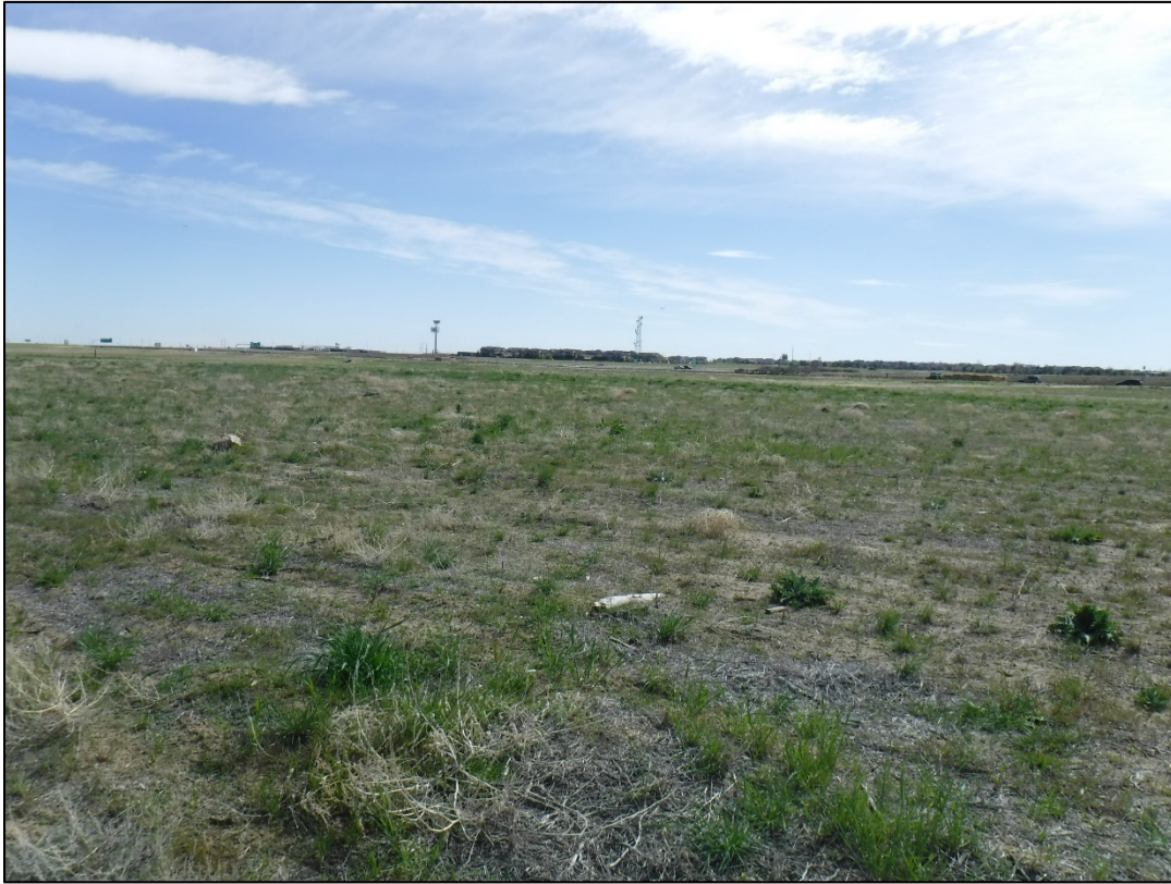
Photo 5: Looking east across the site from the southwestern area of permit