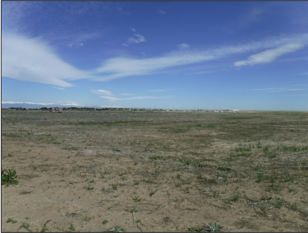
Photo 3: Looking northwest across the site from the southeastern corner of permit