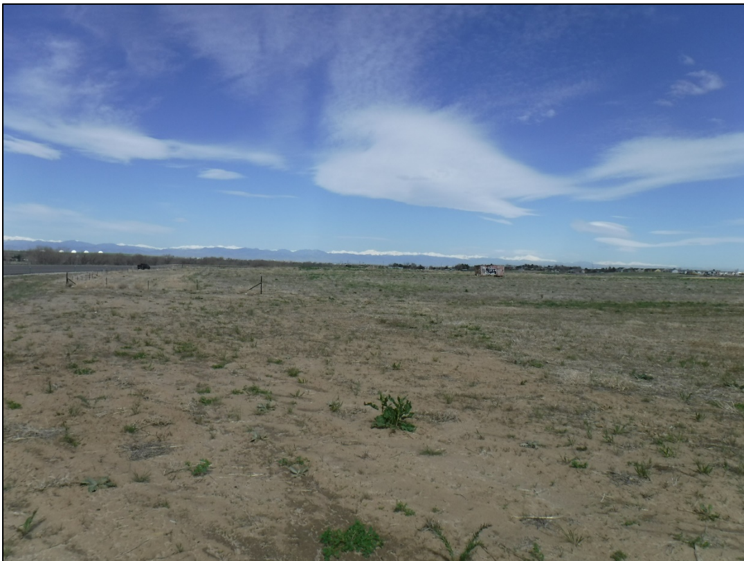
Photo 4: Looking west across the site from the southeastern corner of permit