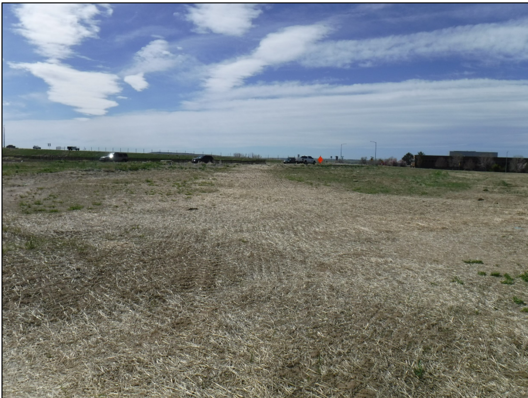
Photo 6: Area disturbed by the swale construction, northeastern part of permit