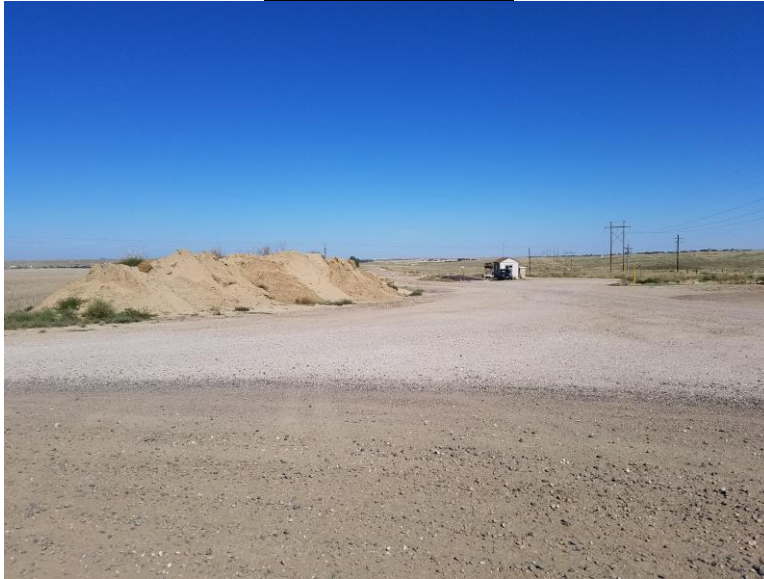
Figure 1. From the entrance to the permit area in the southeast corner of the site looking north. Scale house and scale.