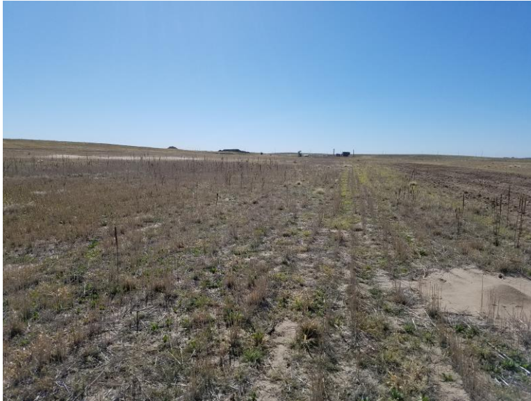
Figure 6. From the northwest corner of the permit area looking south at the reclaimed land.

Wayne Brantley Pioneer Sand Company, Inc. 630 Plaza Drive, Suite 150 Highlands Ranch, CO 80129