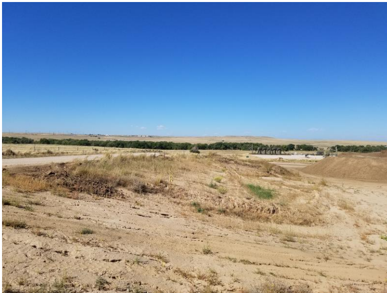
Figure 2. From the southeast corner of the active mine area looking west.