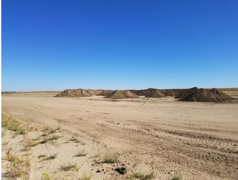
Figure 5. Stockpile area located east of the main mine area.