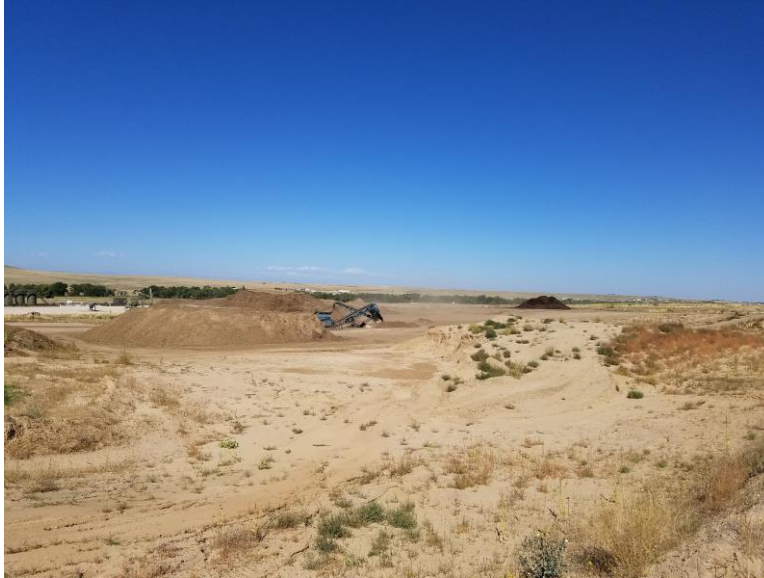
Figure 3. From the southeast corner of the main mine area looking northwest.