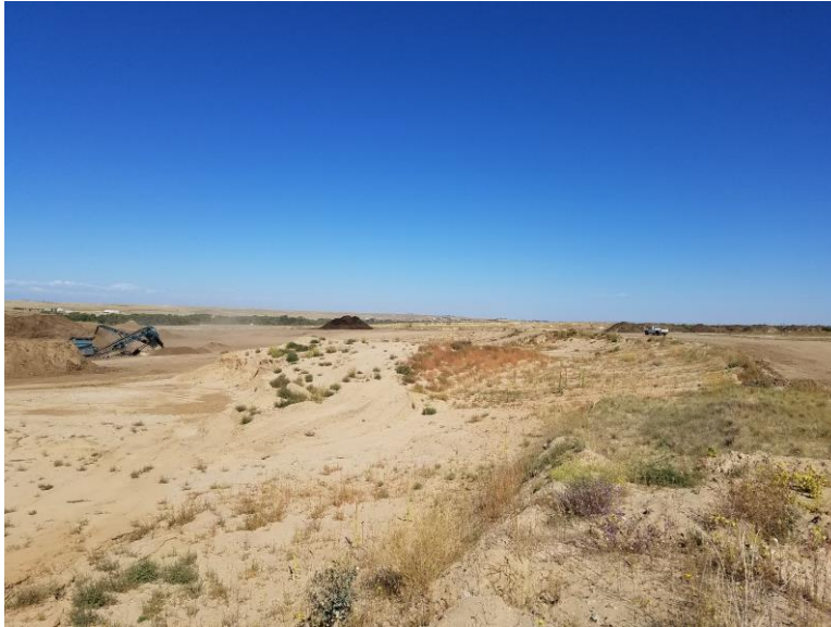
Figure 4. From the southeast corner of the main mine area looking north.