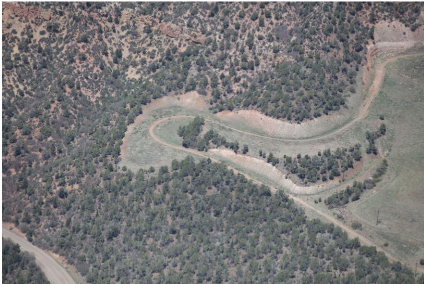
Road west of the RDA at the East Mine

Number of Partial Inspection this Fiscal Year: 7