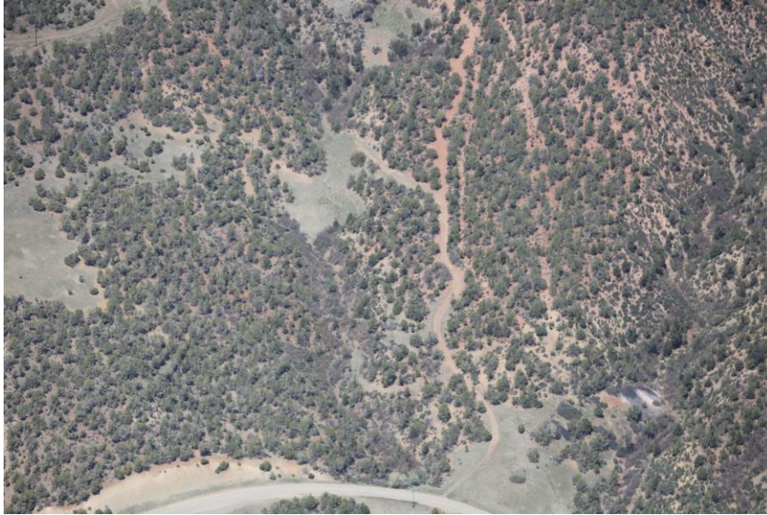
Ponds 3 and 4 at East Mine (center of photo)