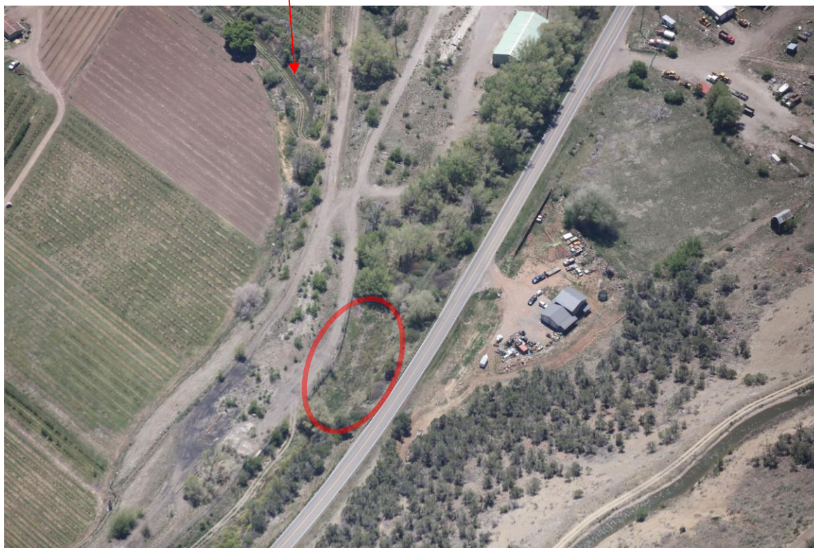
The pond at the loadout (circled)

Number of Partial Inspection this Fiscal Year: 7