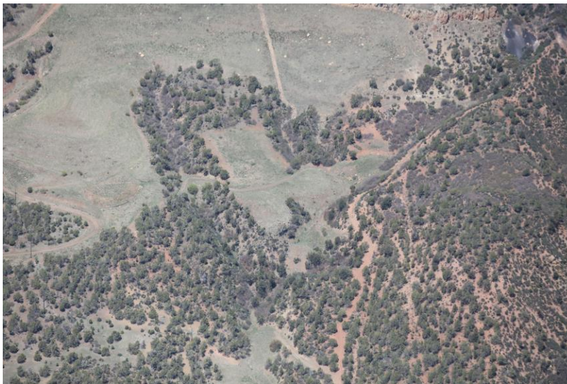
Lower end of the East Mine, including the RDA, the Old Waste Disposal Area, and Ponds 1 and 2

Number of Partial Inspection this Fiscal Year: 7