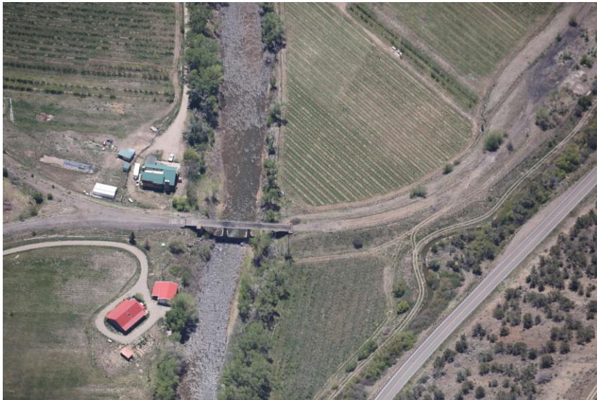
Trestle at the loadout

Number of Partial Inspection this Fiscal Year: 7