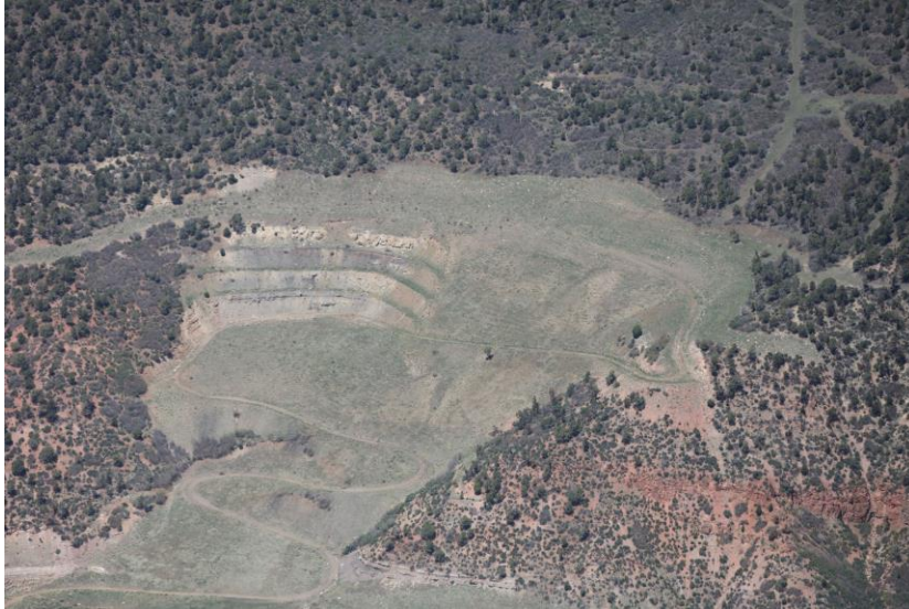
Upper end of the East Mine