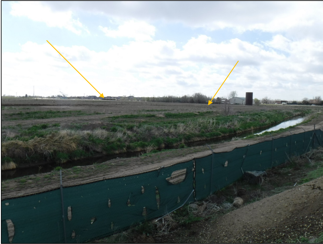
Photo 11: Looking southeast from the northeastern corner of the active area across the AM-03 and 05 areas, arrows are showing the haul road and staged pipes to be brought to the construction area