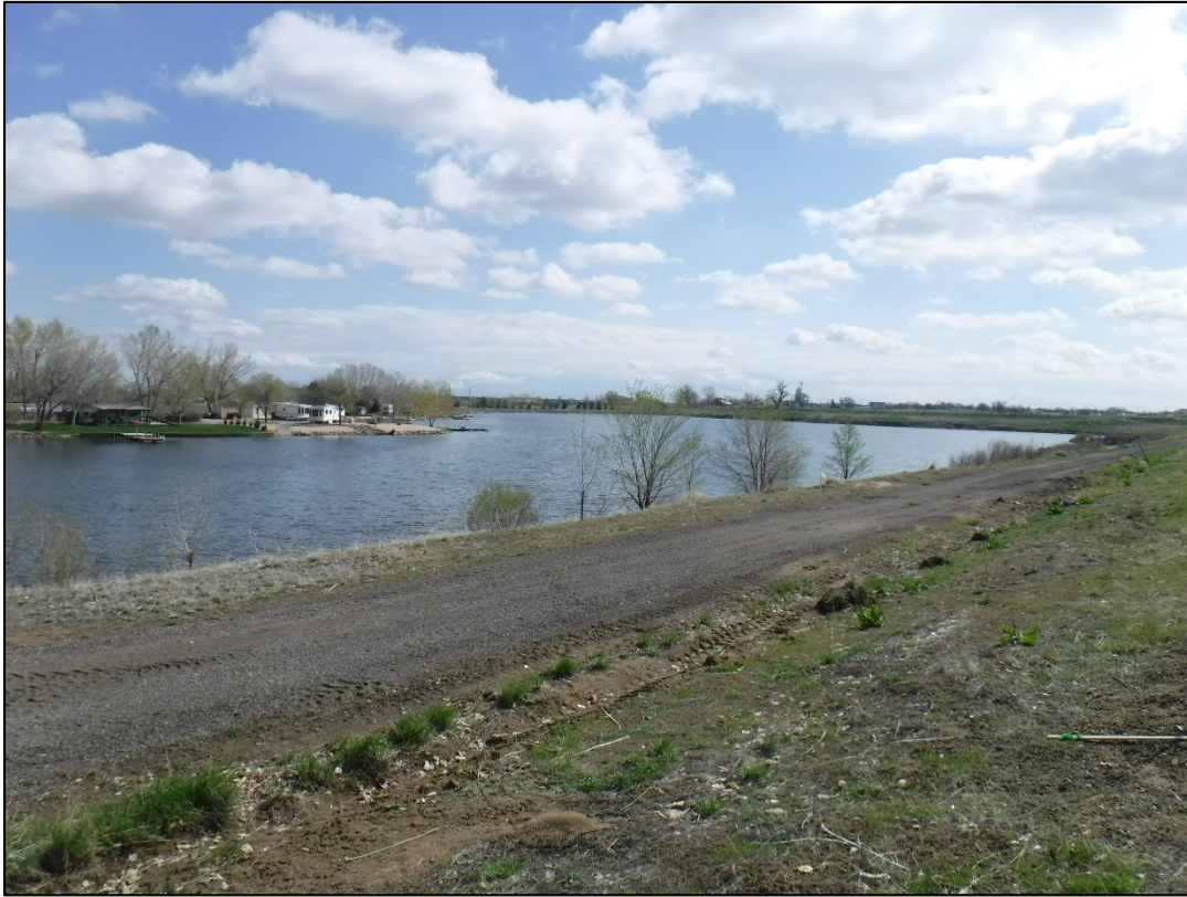
Photo 3: Looking northeast along the ski lake southern shore, no mining disturbance