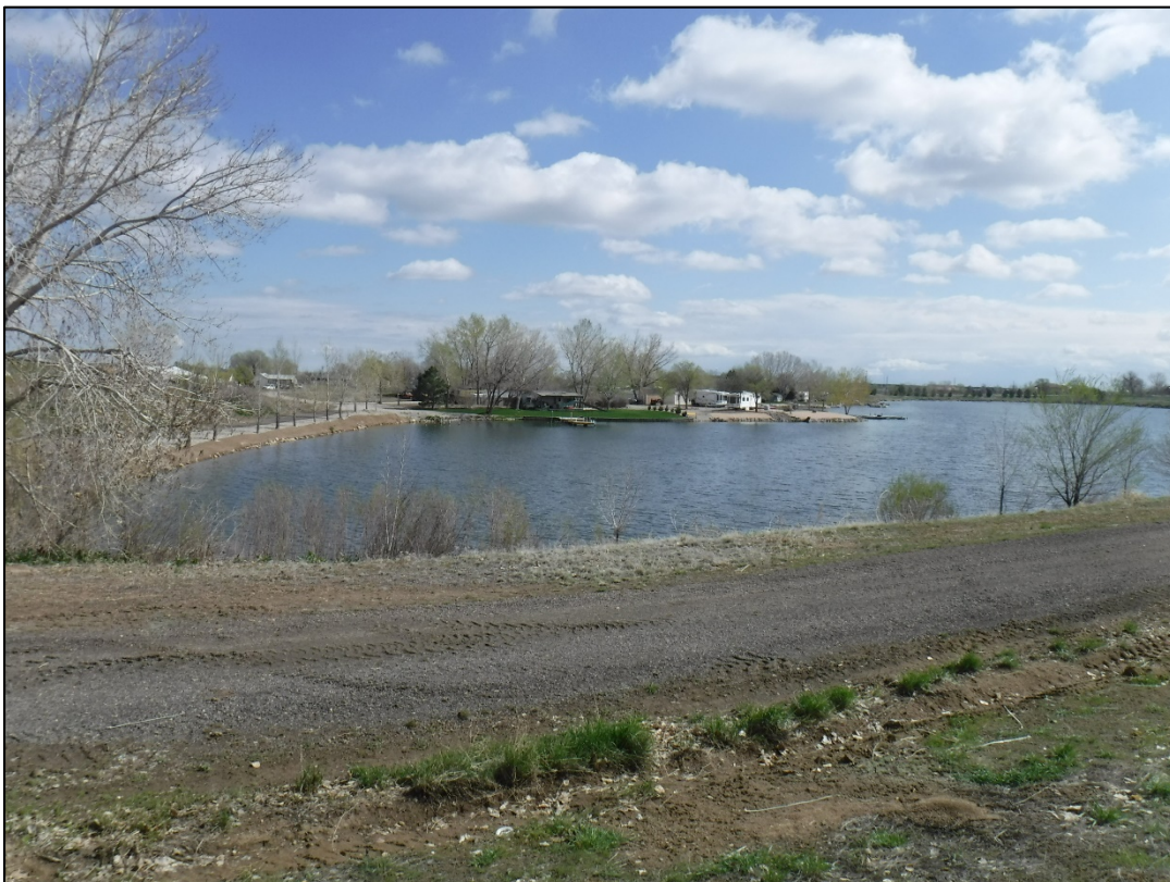
Photo 2: Looking north at the ski lake where the 5 acres are located, no mining disturbance