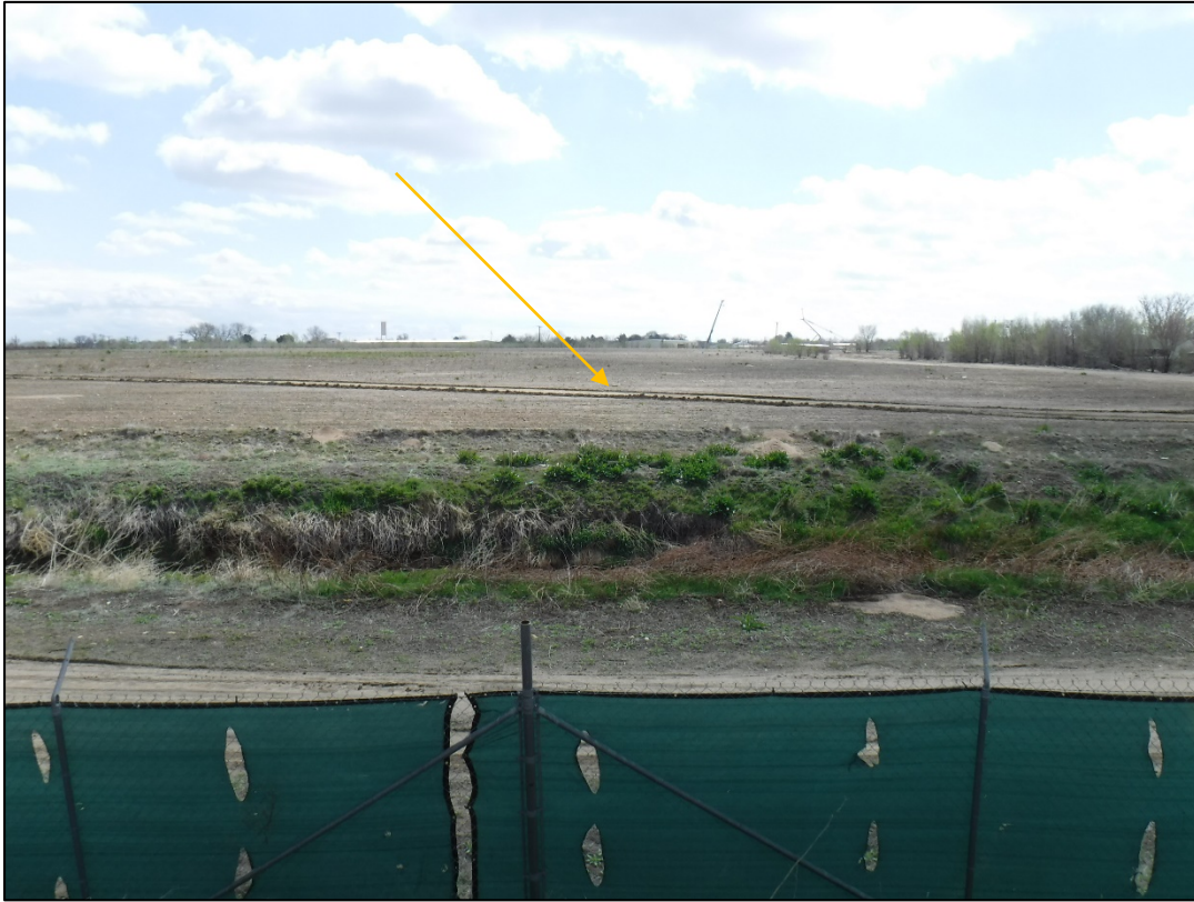
Photo 7: Looking east from the eastern boundary of the active area to where AM-03 and 05 areas are located, arrow is pointing to a haul road being used for the pipeline access