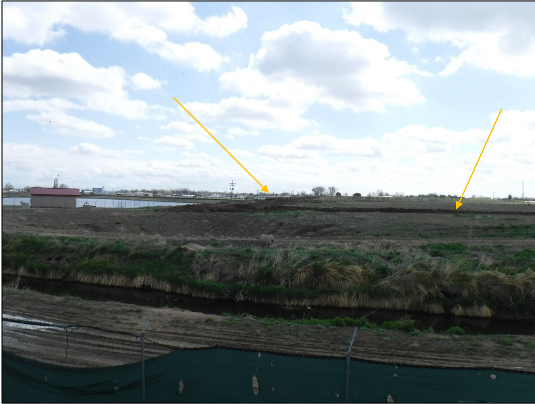
Photo 9: Looking east from the northeastern boundary of the active area to where AM-03 and 05 areas are located, arrow is pointing to a haul road being used for the pipeline access and staged pipes