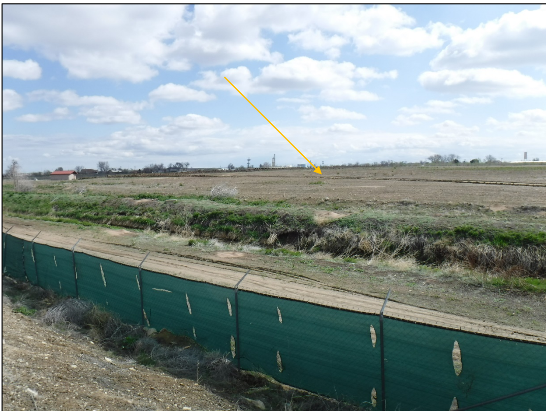
Photo 8: Looking northeast from the eastern boundary of the active area to where AM-03 and 05 areas are located, arrow is pointing to a haul road being used for the pipeline access