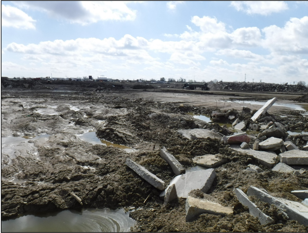
Photo 5: Area located in the west central area where groundwater was last covered in material