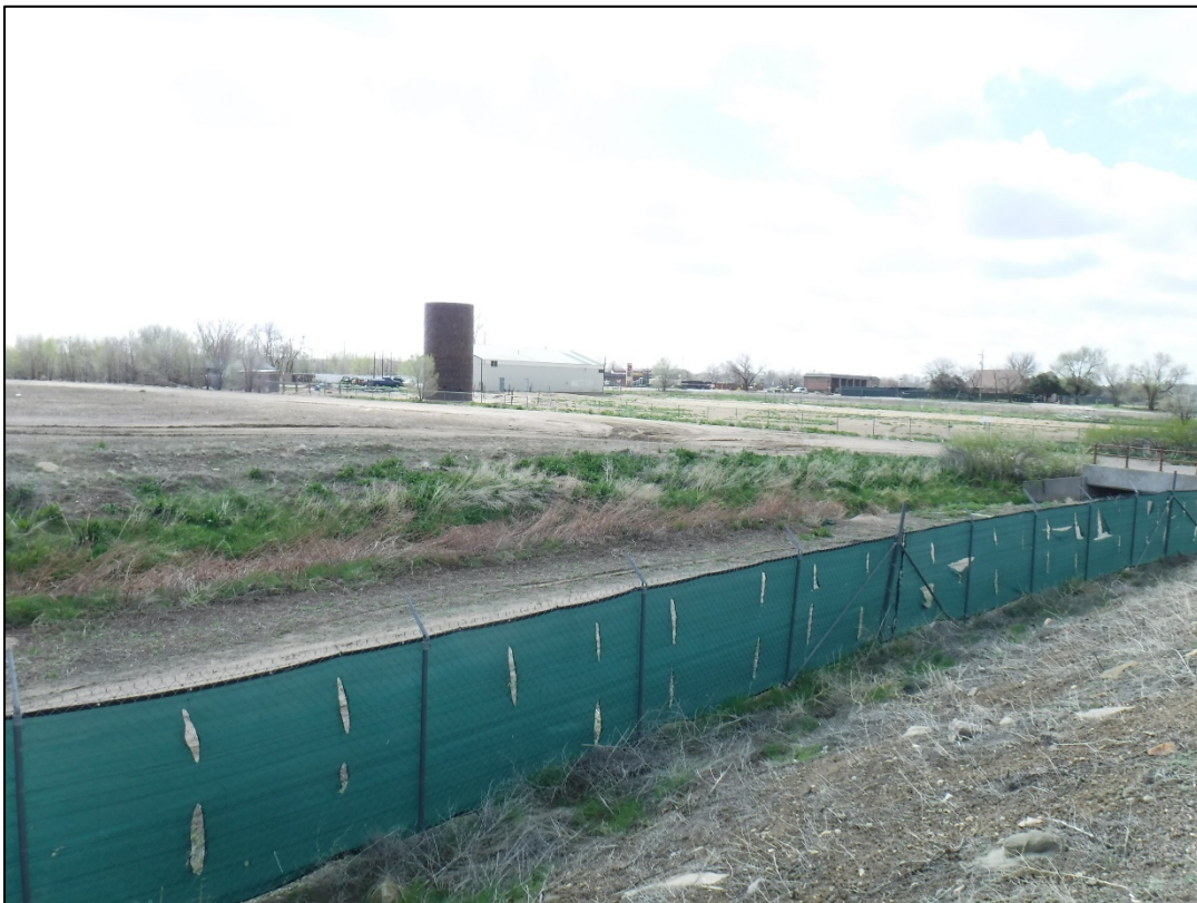
Photo 6: Looking southeast from the eastern boundary of the active area to where AM-03 and 05 areas are located