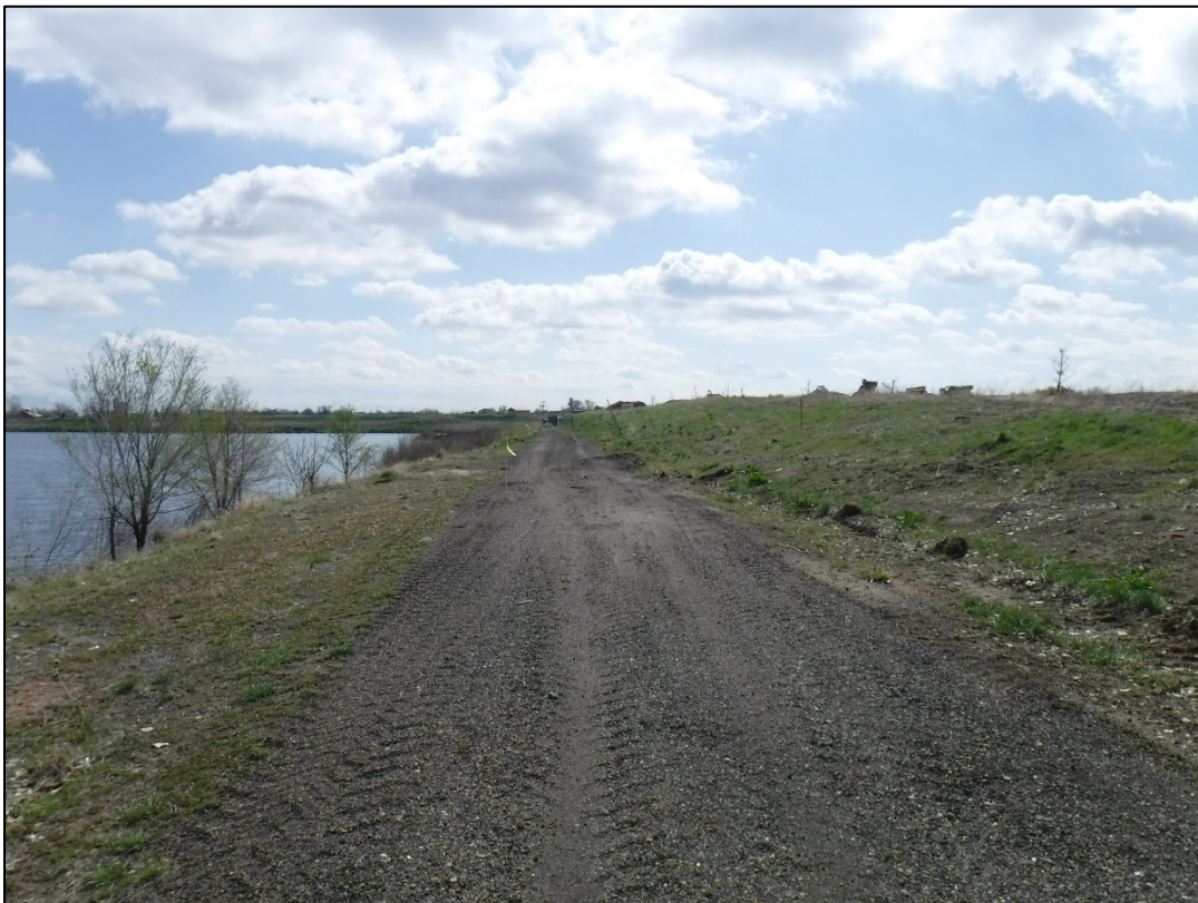
Photo 4: Looking east along the approximate alignment of concrete pipeline corridor