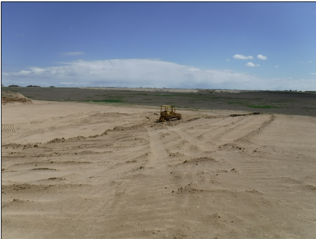
Photo 4: Mining being completed to leave an approximate 3H:1V slope