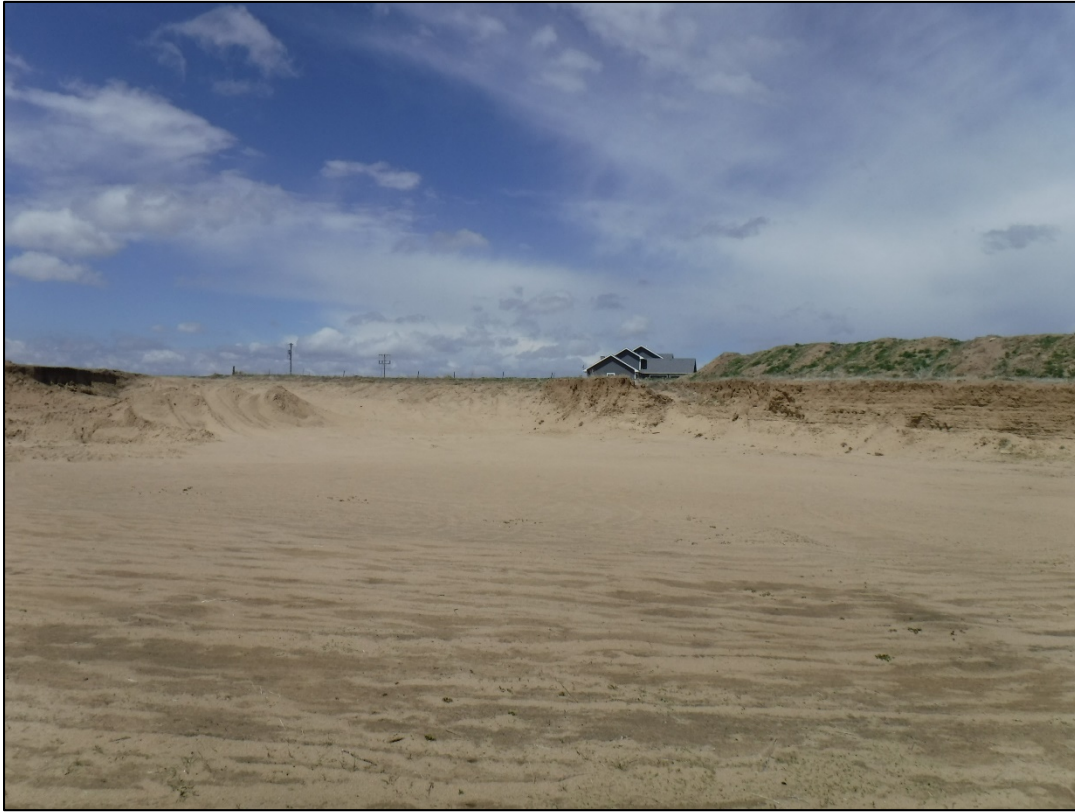
Photo 5: Looking west across mine area, topsoil stockpile to right of picture has green vegetation growing