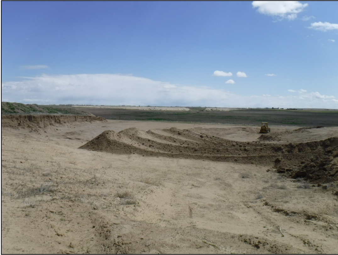
Photo 3: Looking east across mine area and recent disturbance along the southern mine area