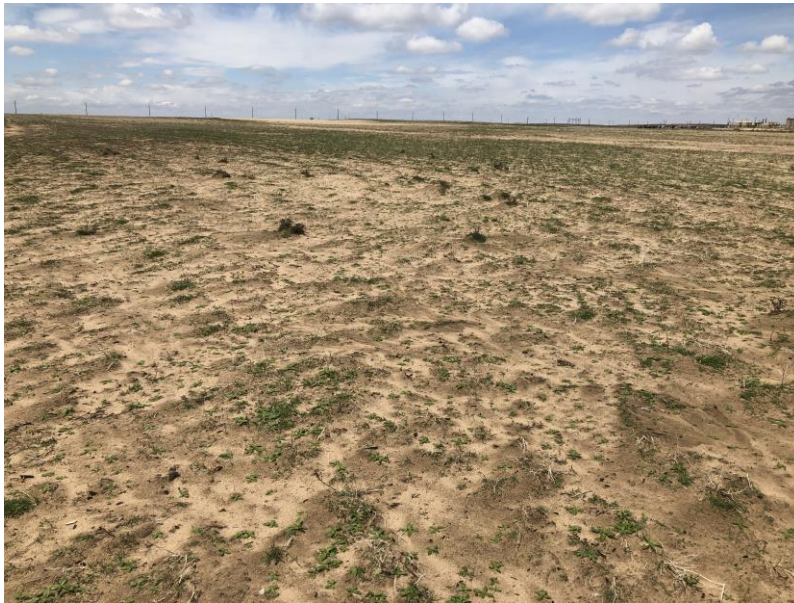
Emerging vegetation on reclaimed topsand pile (north side)