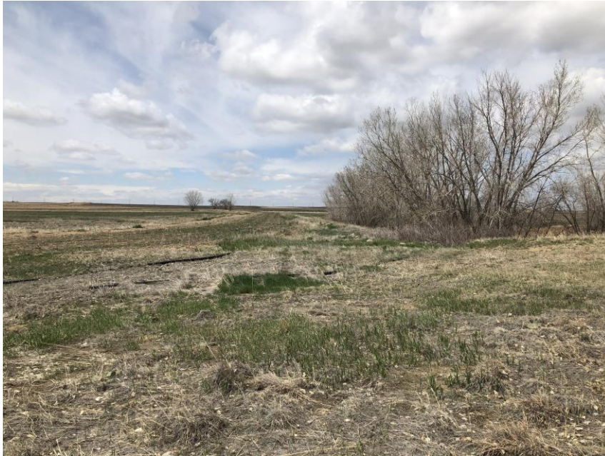
Sediment Pond 2 (on right) and reclaimed road