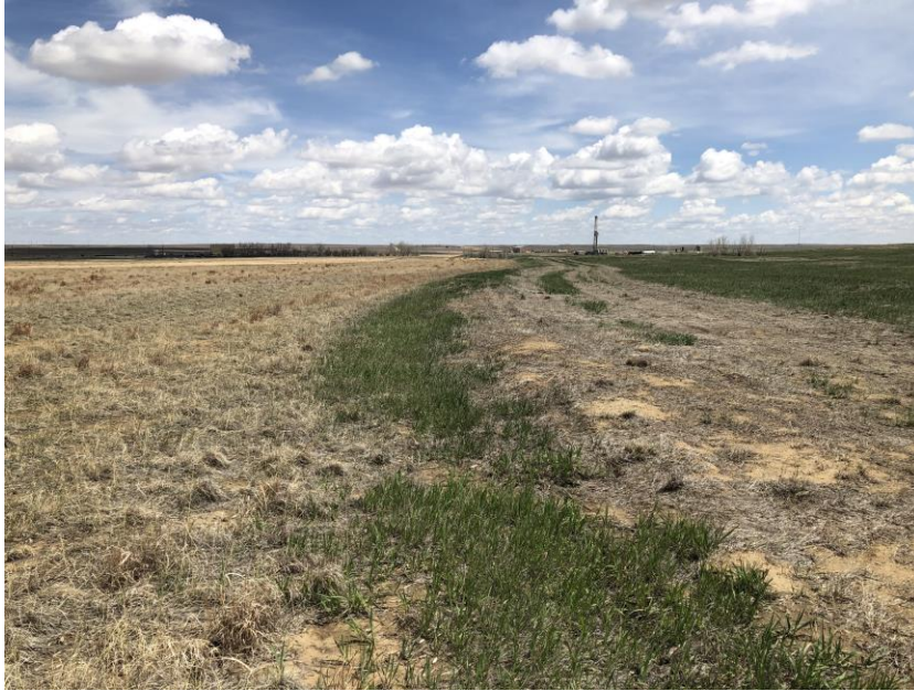
Area 33 on left (area on right is outside current permit)