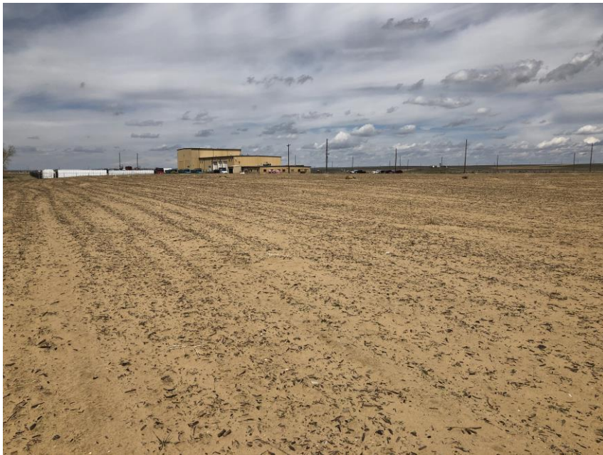
Reclaimed topsoil south of facilities area

Number of Partial Inspection this Fiscal Year: 8