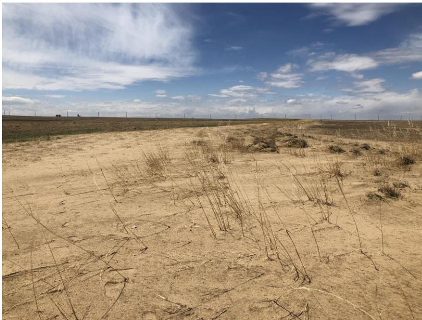
Sand blown onto east side of Area 33

Number of Partial Inspection this Fiscal Year: 8