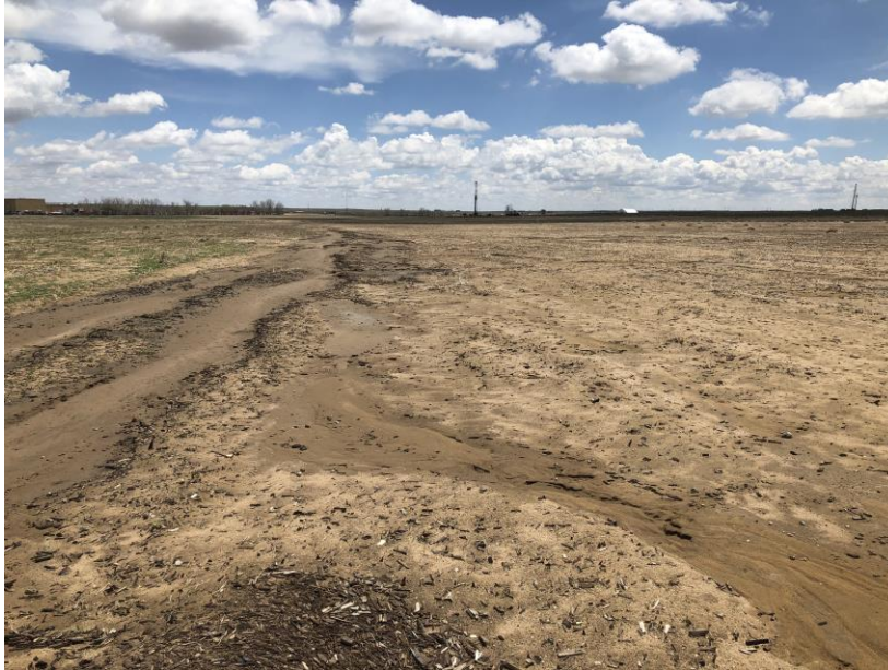
Erosion on Long Term Spoil Area