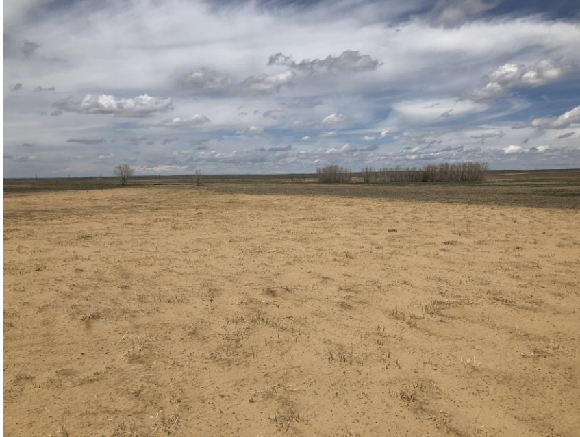
Sand blown onto west side of Area 25