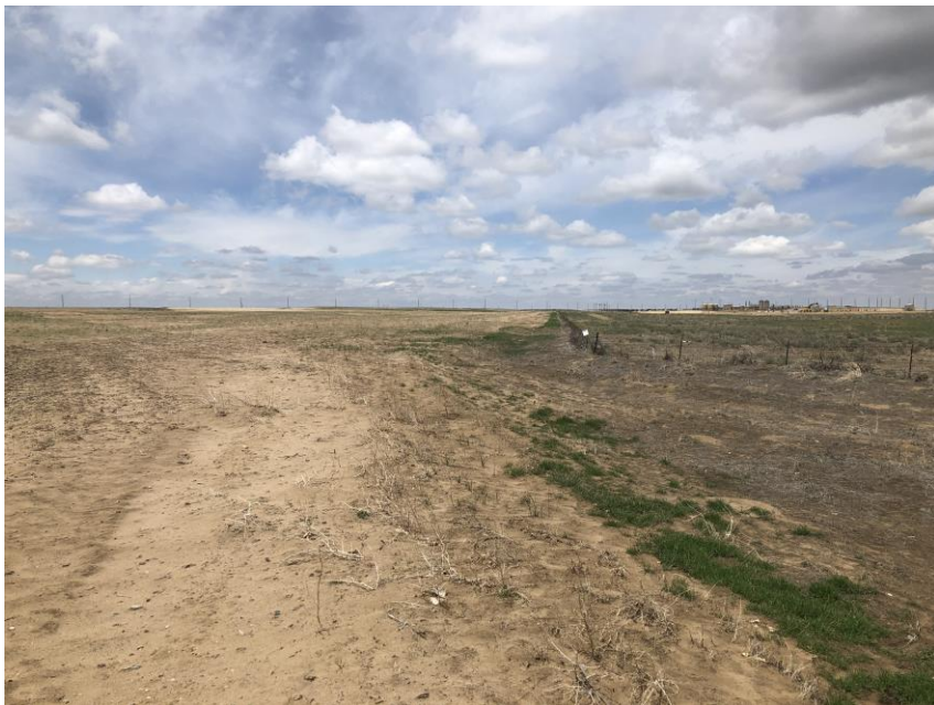
North side of site, looking northwest

Number of Partial Inspection this Fiscal Year: 8