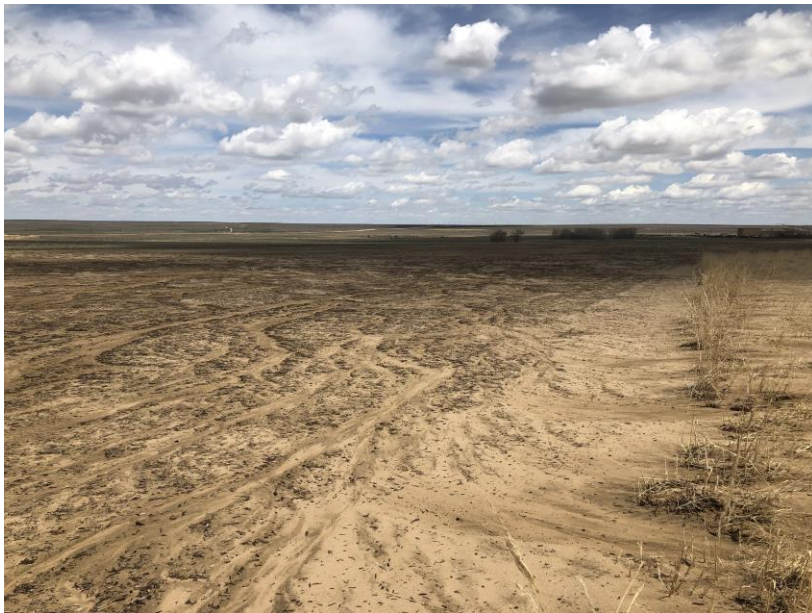
Erosion on south end of the B Pit area

Number of Partial Inspection this Fiscal Year: 8