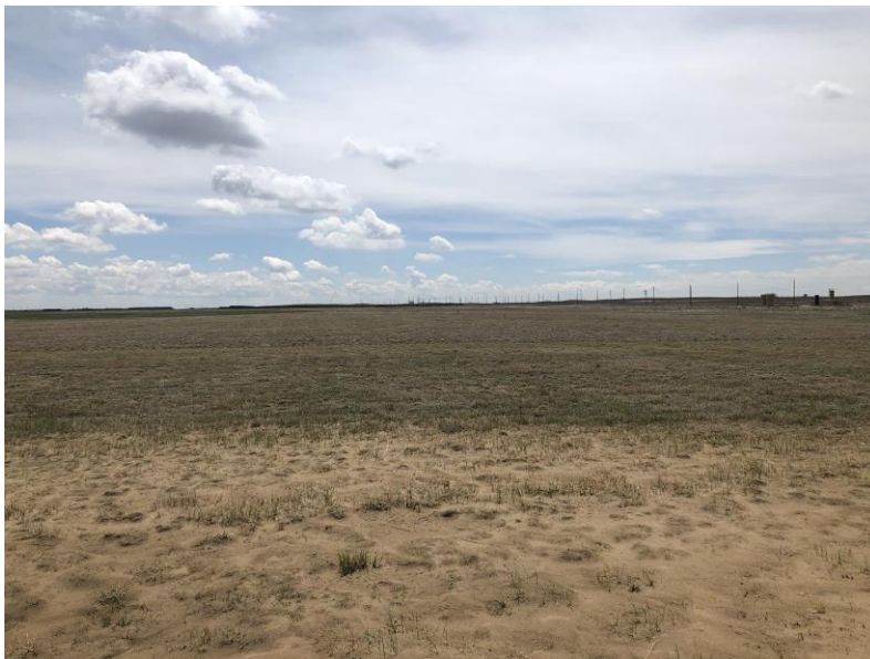
Mature reclamation south of the B Pit area

Number of Partial Inspection this Fiscal Year: 8