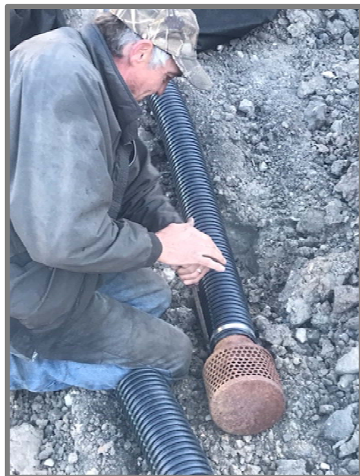
Cap placed on outlet of underdrain