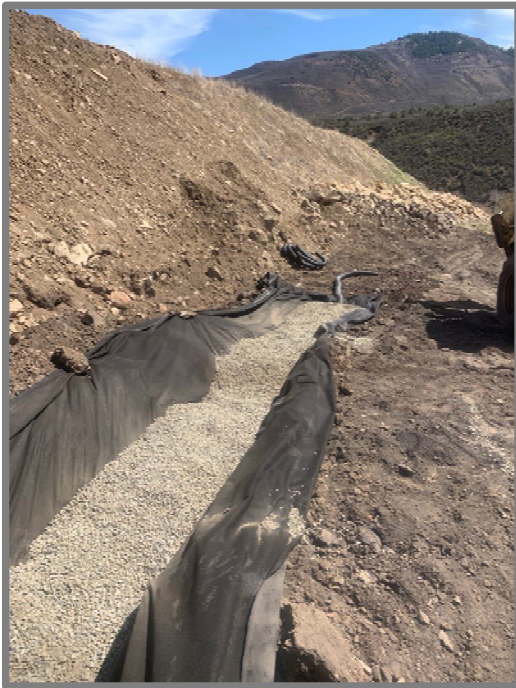
End of Underdrain section