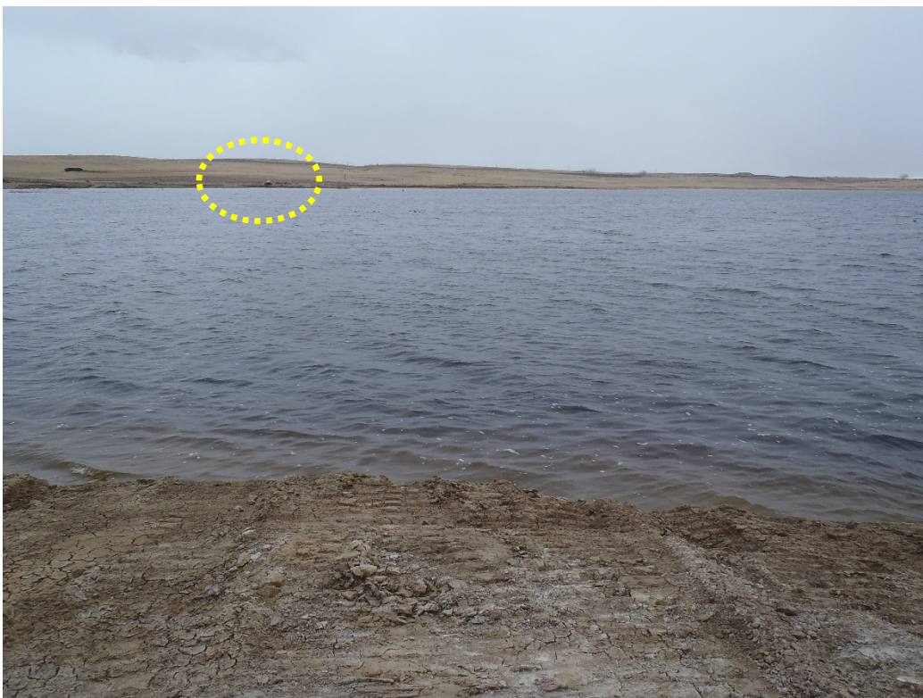
Photo 4. Graded bank (foreground) and contractor excavator (circled, looking NE).