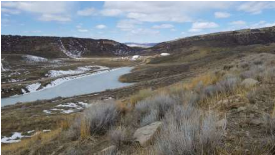
Photo looking west down to Pond 2