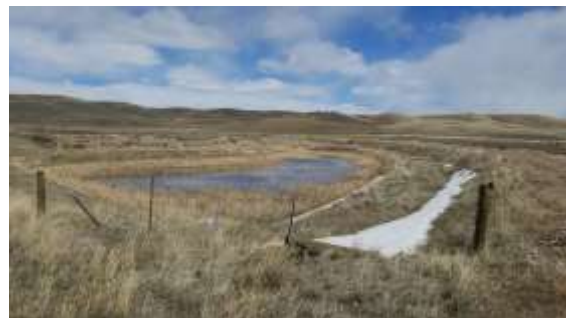
Rail loop pond

Number of Partial Inspection this Fiscal Year: 6