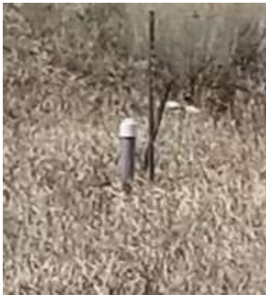
Alluvial monitoring well

No enforcement actions were initiated as a result of this inspection, nor are any pending.