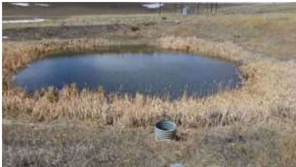
Truck load out pond