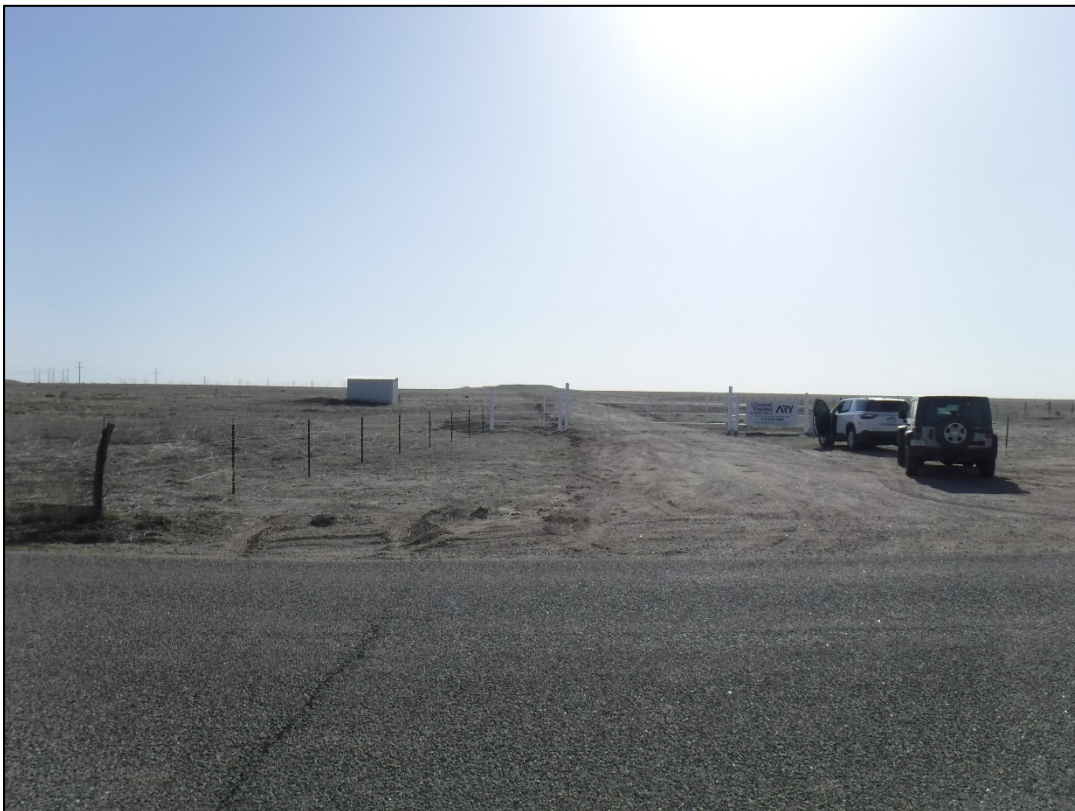
Photo 4: Looking east, 40 th Lane crossing, from west side of road