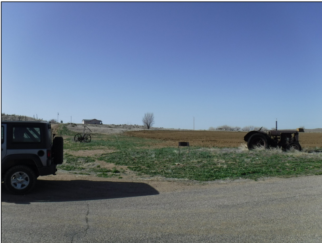
Photo 8: North haul route alignment looking south towards private property, unaffected by mining