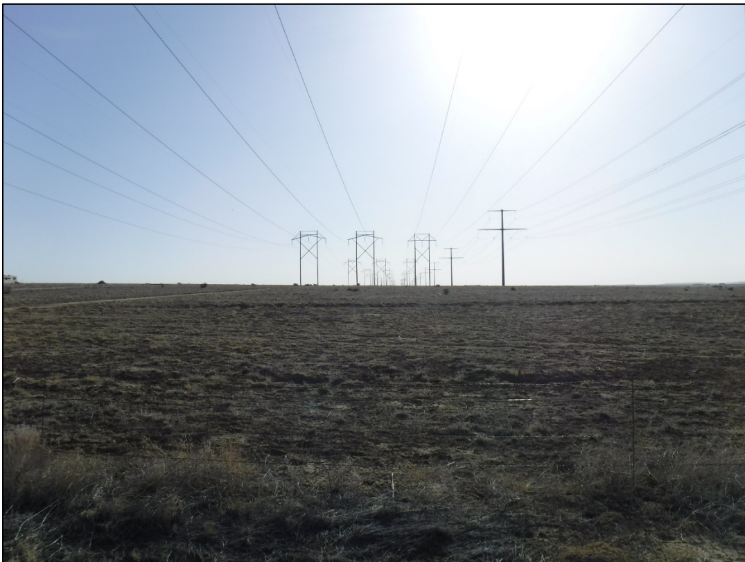
Photo 6: Area of the approved southern haul route where it intersects 36 th Lane, unaffected