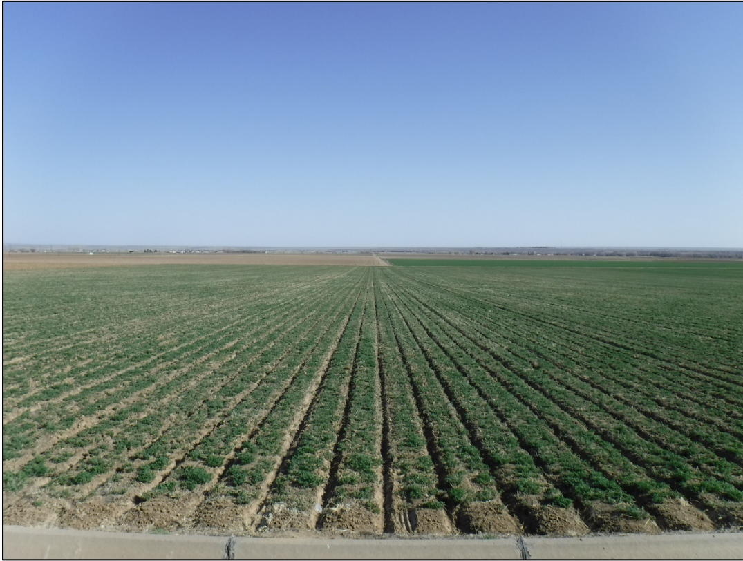
Photo 7: North haul route alignment looking north towards Hwy 50, unaffected by mining