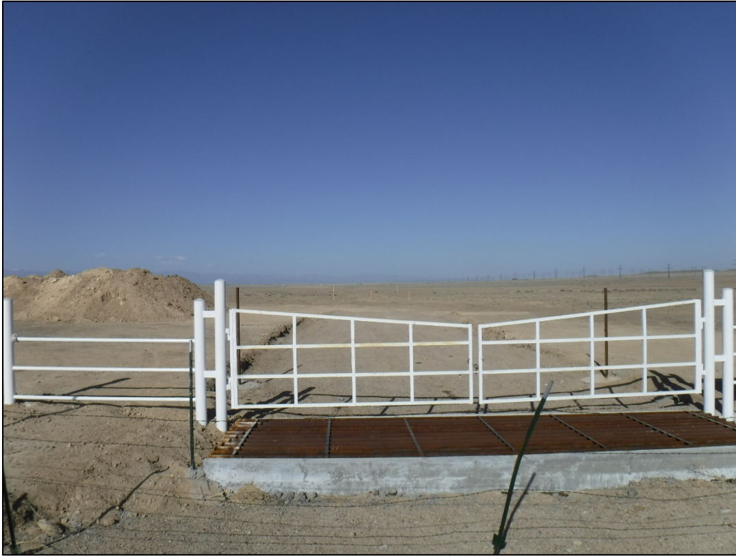
Photo 3: Looking west, 40 th Lane crossing, PVC markers center of photo mark edges of proposed haul road