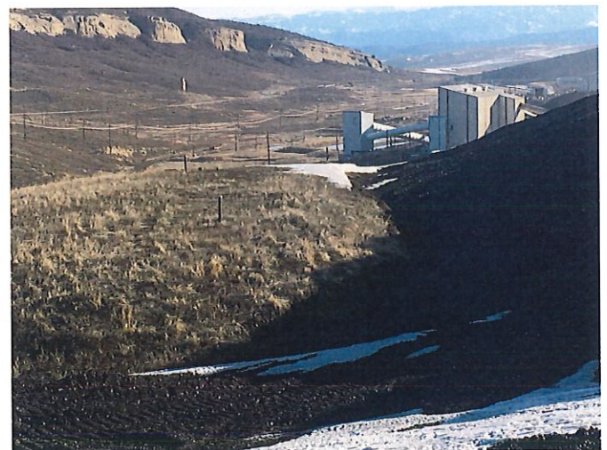
March 31, 2021- RW#1 and RW#2, North of Expansion Area