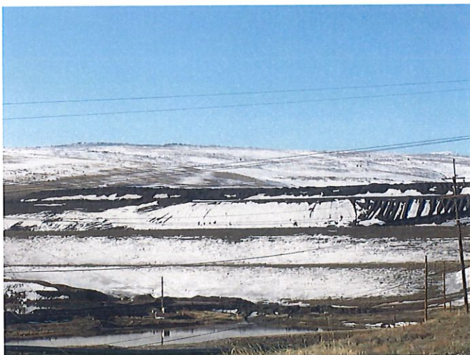
March 31, 2021-Benches on East Side of Refuse Pile