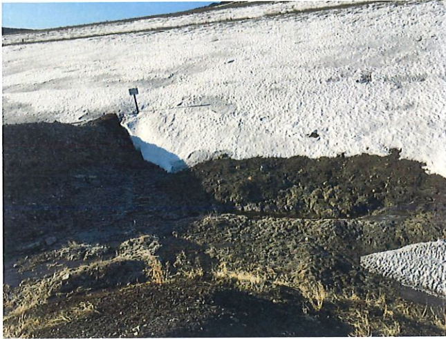
March 31, 2021-Drain Outlet and Seepage Area