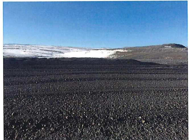
March 31, 2021-Area 2,3 4 from Expansion Area