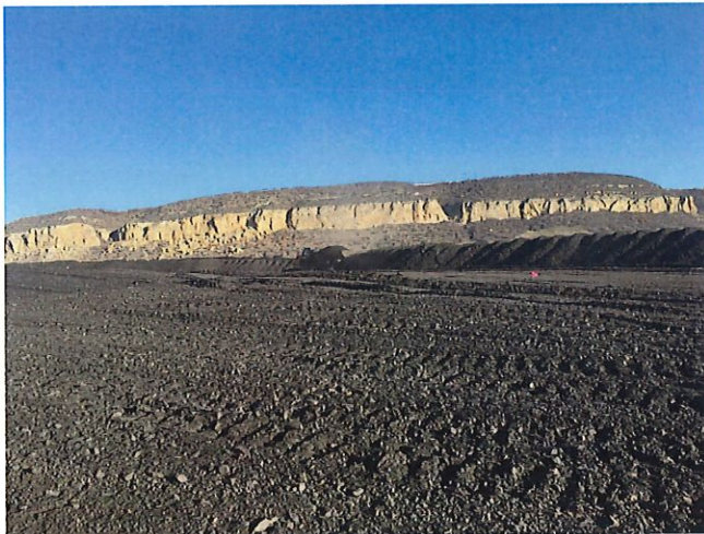
March 31, 2021- Expansion Area Stockpiles