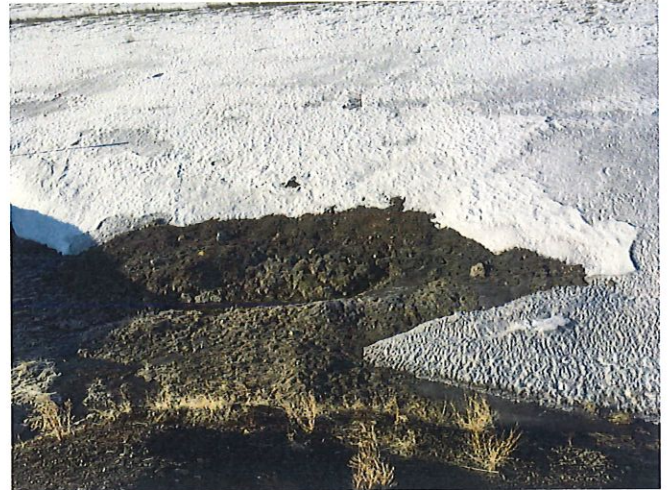
March 31, 2021-Seepage Area