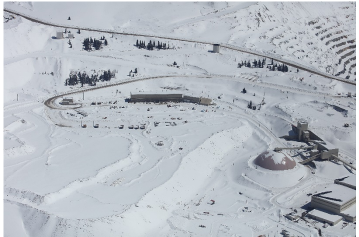
North 40 OSF/Mill Area