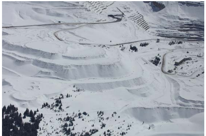
McNulty OSF/Pit Area