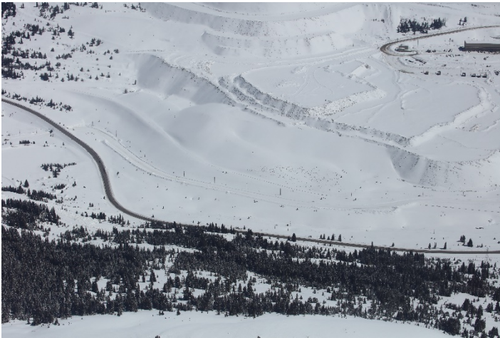
North 40 OSF

The North 40 and McNulty OSF's were observed. Deposition was occurring during this inspection, in the upper north part of the McNulty OSF. The current OSF operating plan was drafted by Golder Associates in December 2016. The plan was submitted to the Division as part of TR-25. In the Plan Golder states that snow accumulations of up to 2-3 feet on OSF faces do not significantly impact operation of large OSFs, however larger accumulations greater than 3 feet can become trapped as a continuous layer and form a weak layer or saturate finer grained layers as melting occurs. Therefore Golder recommended that waste rock only be deposited on slopes with less than 3 feet of snow accumulation. Accumulated snow was not observed in the area of deposition. Climax appears to be in compliance with Golder recommendations for OSF operations. No problems were noted with the OSF's.