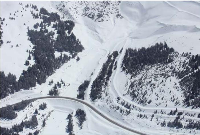
McNulty OSF Expansion Area