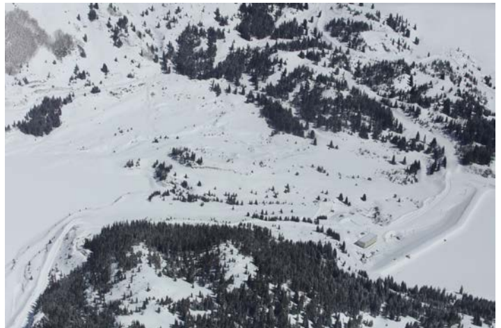
Eagle Park Reservoir