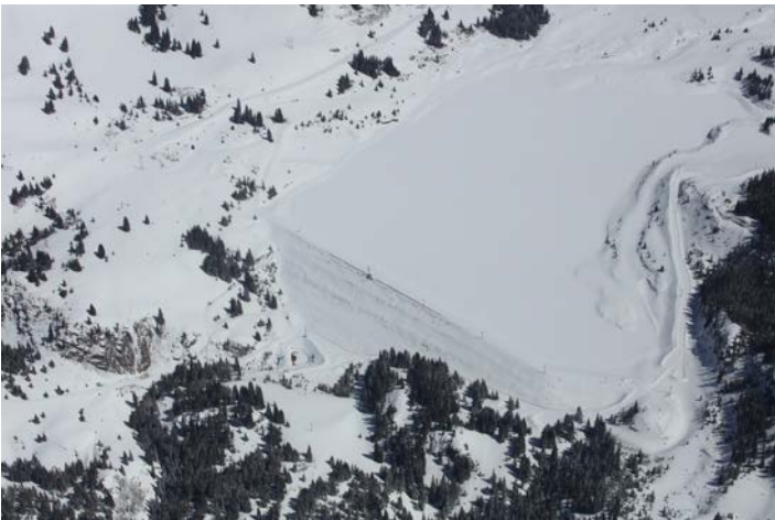
Eagle Park Reservoir / 4 Dam