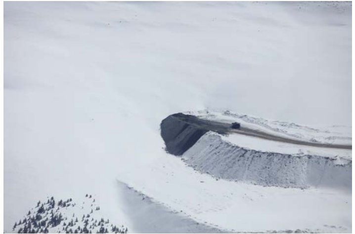
Dumping at McNulty OSF

No problems or violations were noted during this inspection.