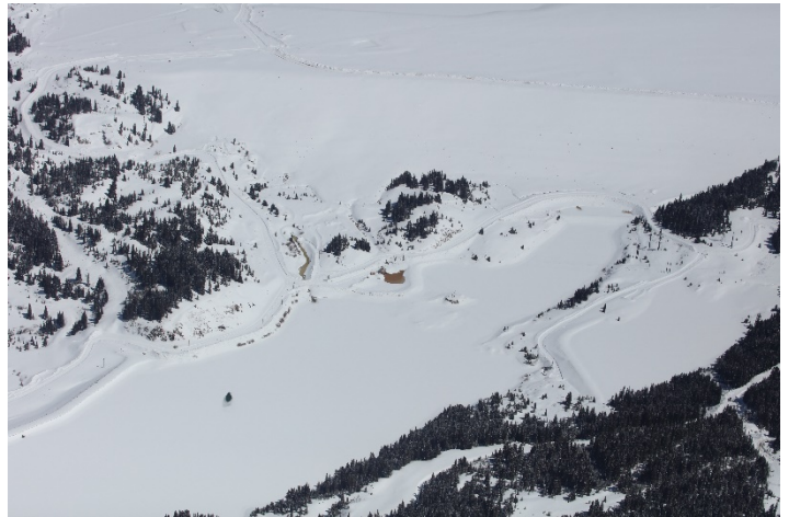
Robinson Lake / 1 Dam