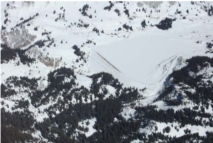
4 Dam and Eagle Park Reservoir

The Mayflower TSF and 5 Dam, Tenmile TSF and 3 Dam, Robinson TSF and 1 and 2 Dams, Robinson Lake, Eagle Park Reservoir and 4 Dam were observed. The area was under thick snow cover. No staining or discoloration were noted at any of the TSF dams. No abnormal conditions were noted. TSF's appear to be functioning within the established design criteria.