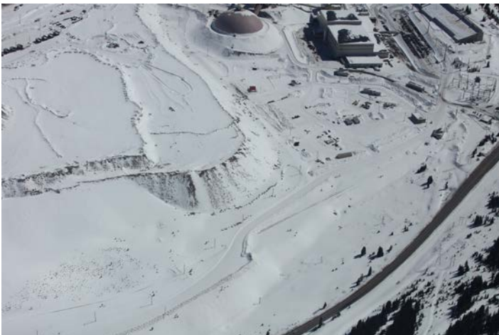
North 40 OSF