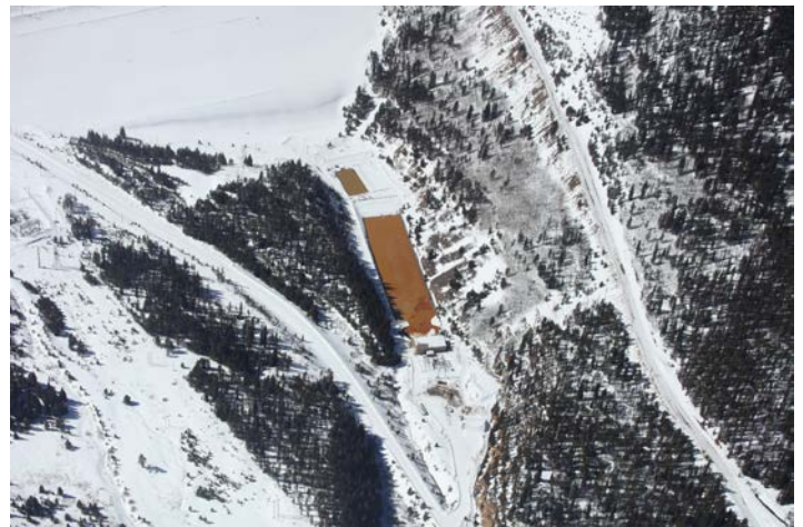
5 Dam and seepwater pump station