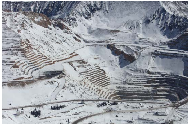
Active pit area

No problems or violations were noted during this inspection.