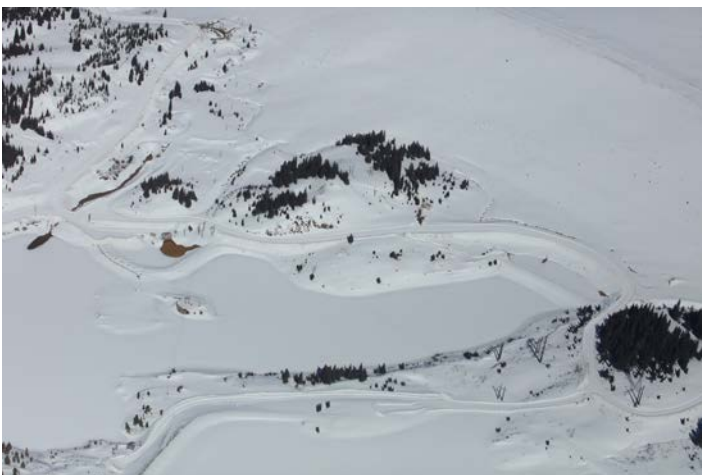
Robinson Lake/Tenmile Tunnel/1 Dam