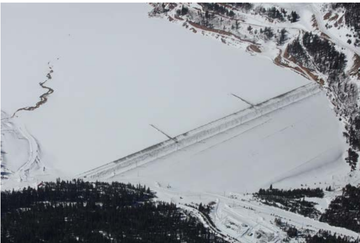
Mayflower TSF/5 Dam