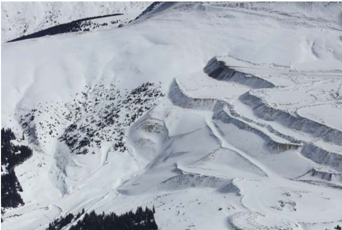
McNulty OSF showing recent deposition at top of dump

The McNulty and North 40 OSF's were observed. Deposition was not observed during this inspection, but evidence of recent deposition is seen at the McNulty OSF. The current OSF operating plan was drafted by Golder Associates in December 2016. The plan was submitted to the Division as part of TR-25. In the Plan Golder states that snow accumulations of up to 2-3 feet on OSF faces do not significantly impact operation of large OSFs, however larger accumulations greater than 3 feet can become trapped as a continuous layer and form a weak layer or saturate finer grained layers as melting occurs. Therefore Golder recommended that waste rock only be deposited on slopes with less than 3 feet of snow accumulation. Climax appears to be in compliance with Golder recommendations for OSF operations. No problems were noted with the OSF's.