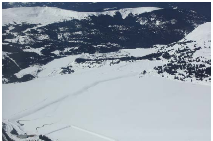
Robinson Pond/2 Dam/Tenmile TSF