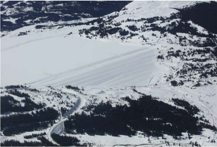
Tenmile TSF/3 Dam