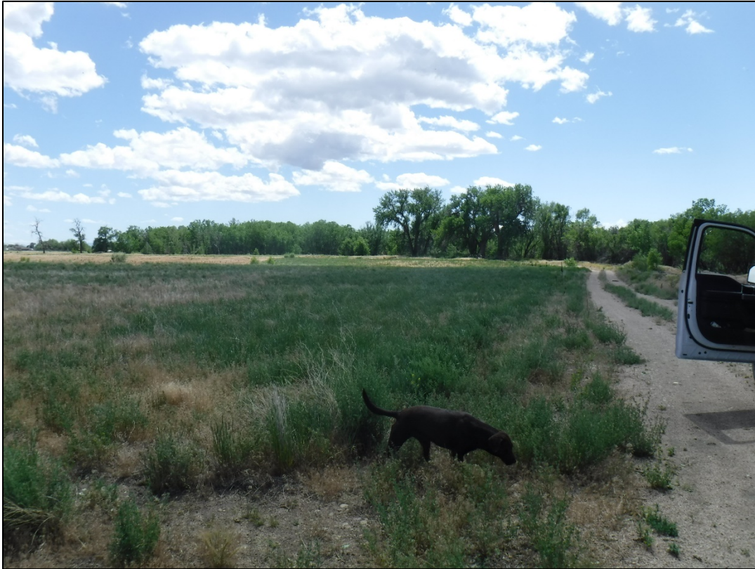
Photo 5: Southern area adjacent to Stage Coach Stop water resources pond looking south, note this photo was taken in June 2020