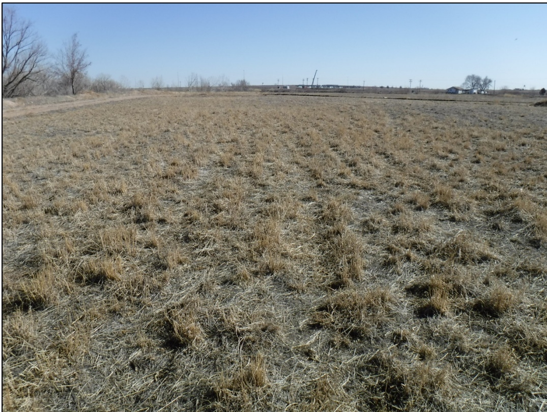
Photo 4: Southern area adjacent to Stage Coach Stop water resources pond looking north