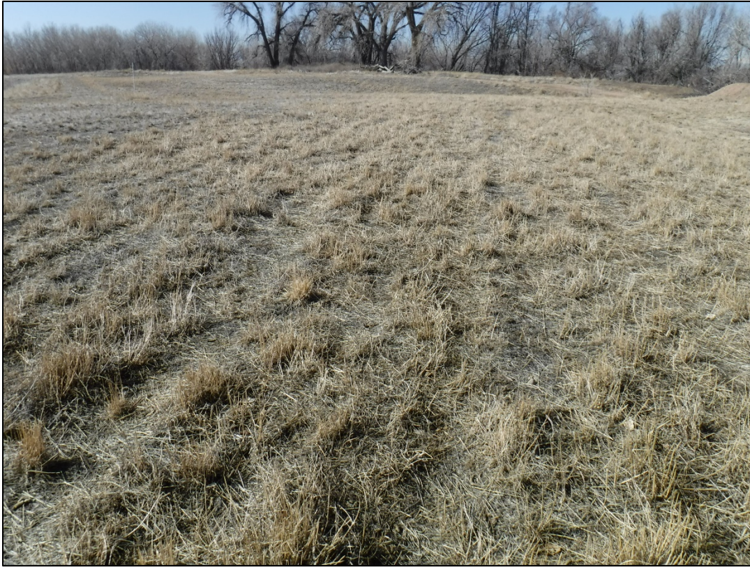
Photo 3: Southern area adjacent to Stage Coach Stop water resources pond looking south