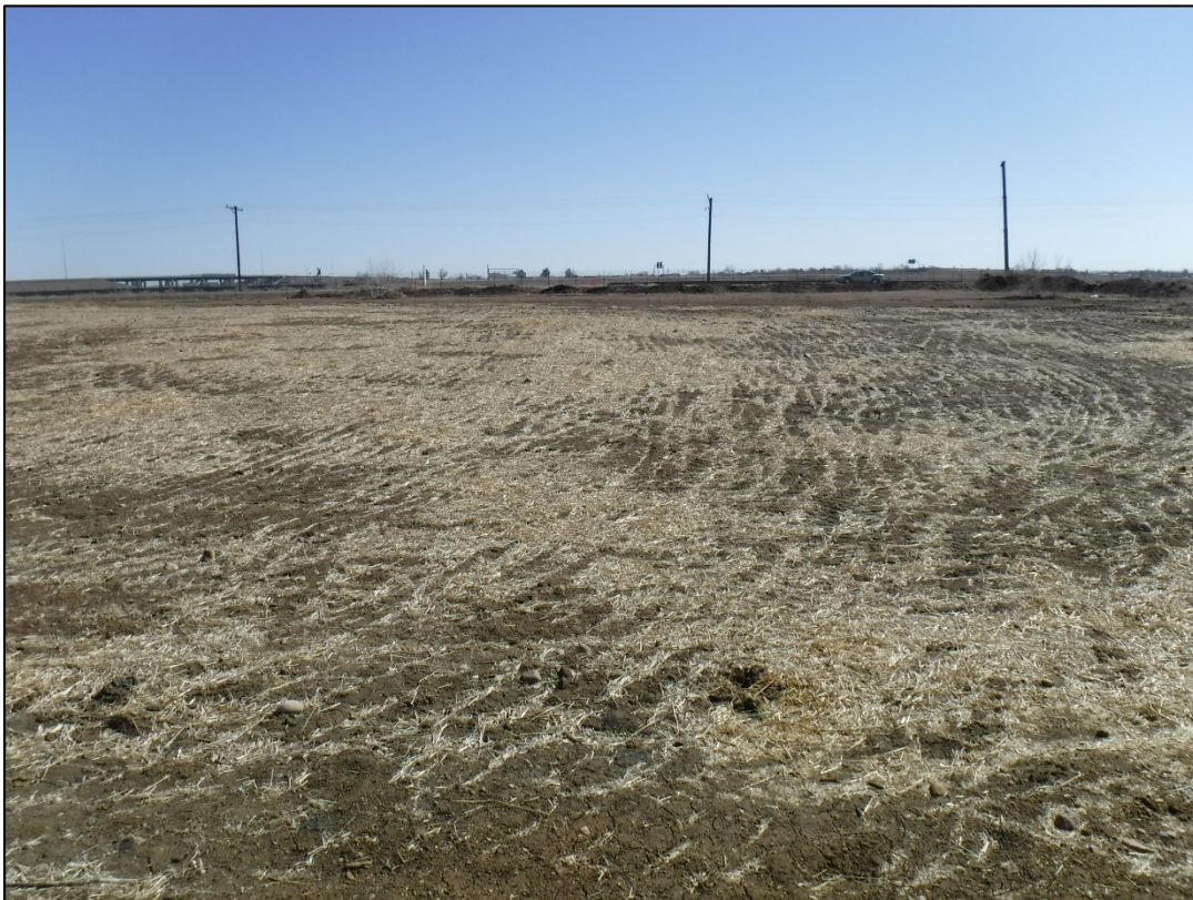
Photo 2: Top portion of the 10.25 acre parcel not meeting vegetation requirements