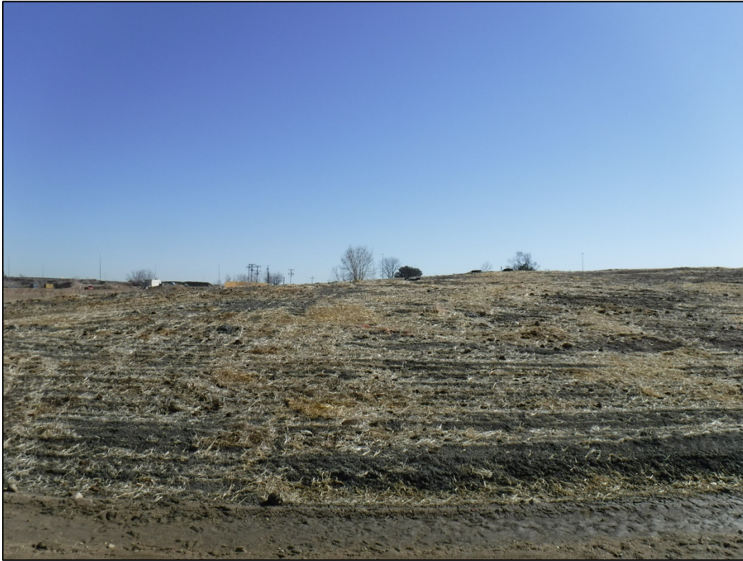
Photo 1: Side slope of the 10.25 acre parcel not meeting vegetation requirements