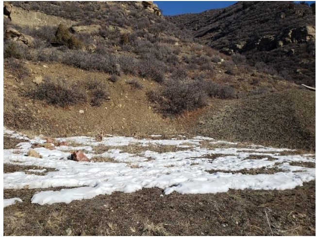
Sanborn Creek Mine Fan Site

In order to meet the Phase III requirement, the establishment of vegetation was inspected to support the post mining land use. Vegetative cover and any observed bare areas were inspected with respect to the post mining land use and the potential for excessive contribution of suspended solids to streamflow outside of the permit area. Species composition was visually evaluated to ensure that predominate species were observed to support the post mining land use. The Elk Creek Mine's vegetation cover and diversity are acceptable and no problems were noted with revegetation at the time of the inspection. No noxious or invasive species were noted during the inspection.