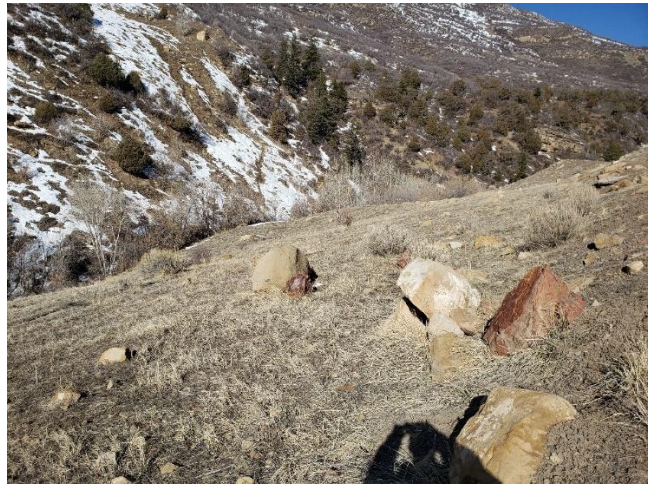
Bear Creek B-Seam Portal & Fan Site