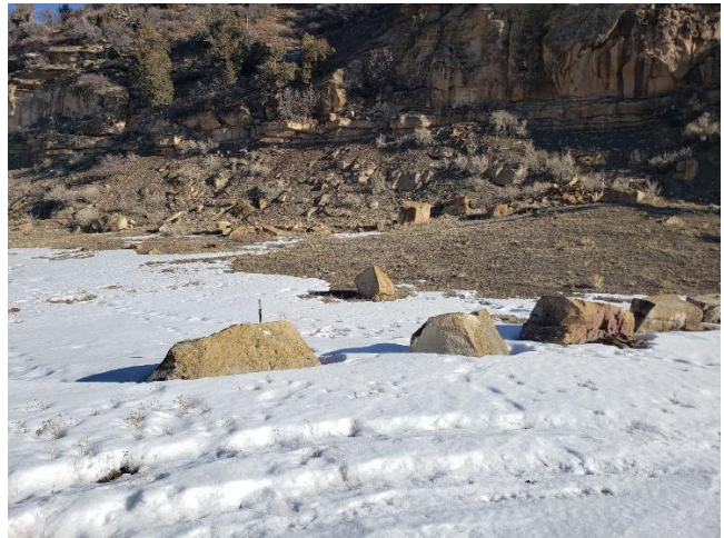
Lower Hubbard Creek Facilities Site

Number of Partial Inspection this Fiscal Year: 6 Number of Complete Inspections this Fiscal Year: 2