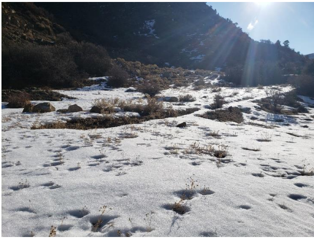
Hubbard Creek Fan #1 Site