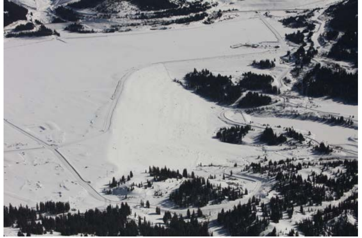
1 Dam and Robinson Pond