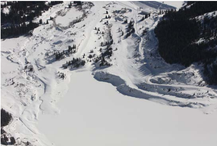
Eagle Park Reservoir

The Eagle Park Reservoir and 4 Dam, Robinson Lake, 1 Dam and Robinson Pond, 2 Dam, Tenmile Pond and 3 Dam, Mayflower TSF and 5 Dam were observed. The area was under snow cover, up to several feet in depth. No staining or discoloration were noted at any of the TSF dams. No abnormal conditions were noted. TSF's appear to be functioning within the established design criteria.