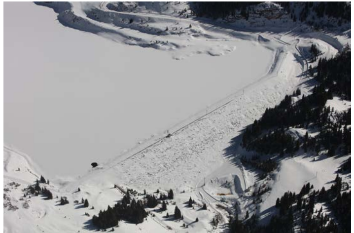
Eagle Park Reservoir and 4 Dam