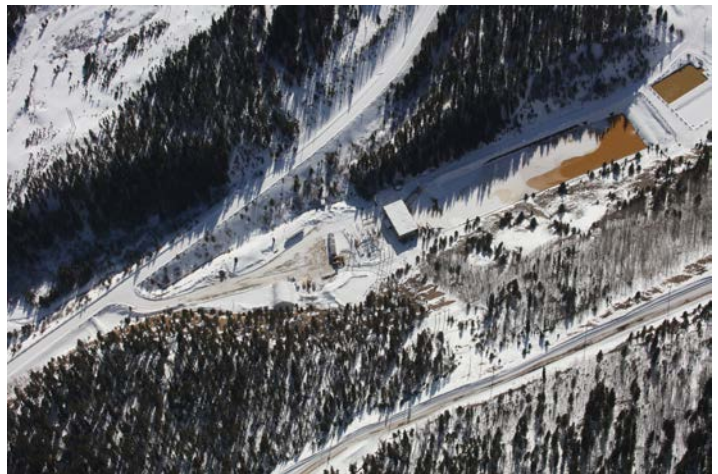
5 Dam Pump Station

No problems or violations were noted during this inspection.