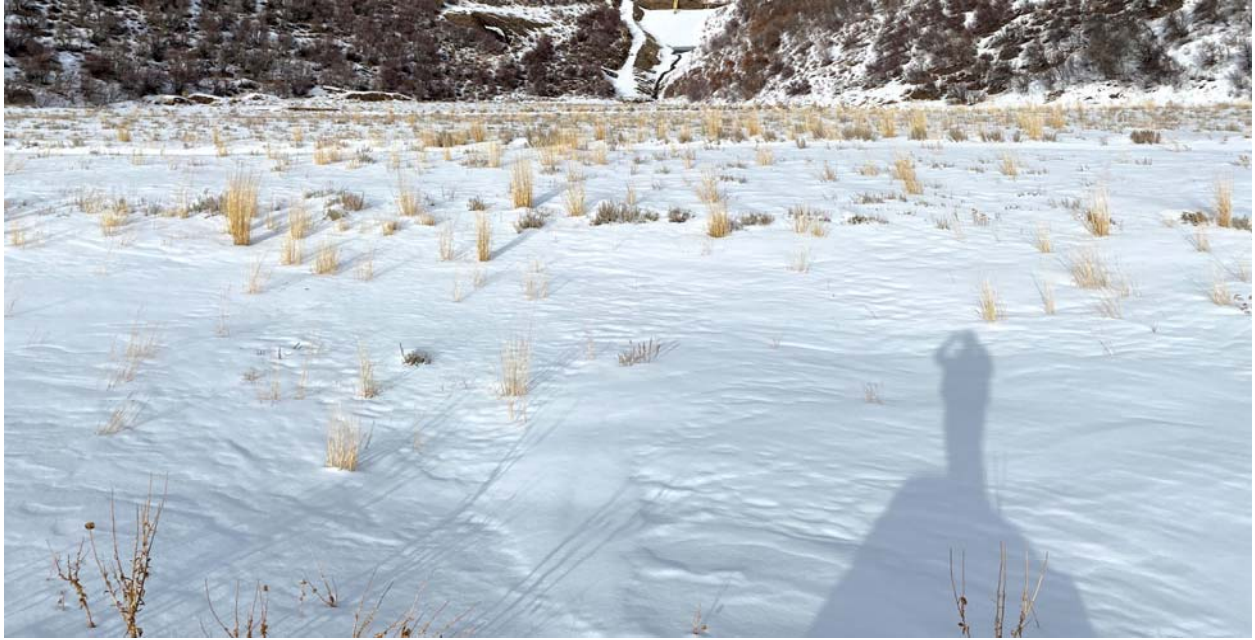
2-01-21 - West Taylor fill looking north from monitoring well location