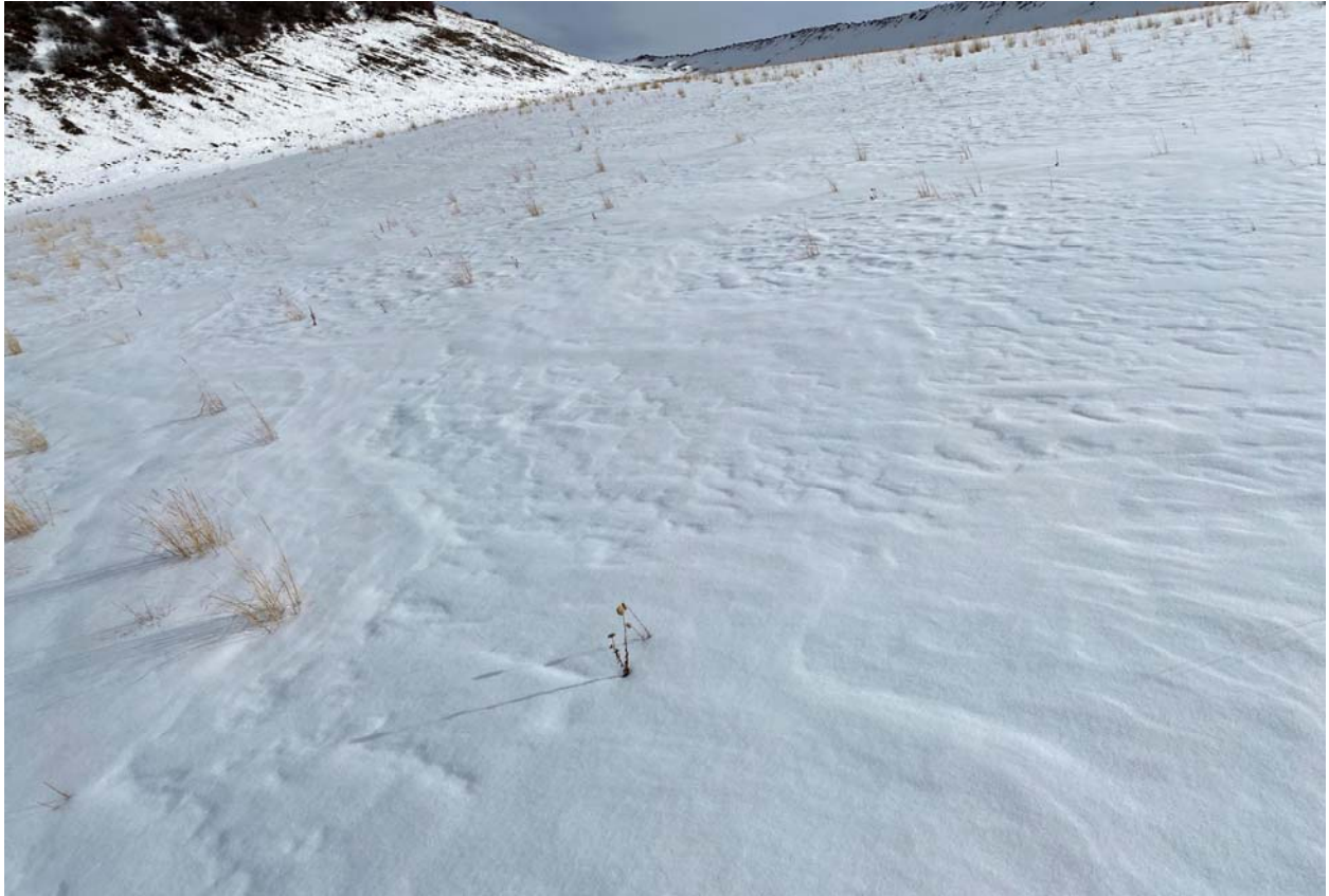
2-01-21 - West Taylor Fill East Flank from monitoring well location