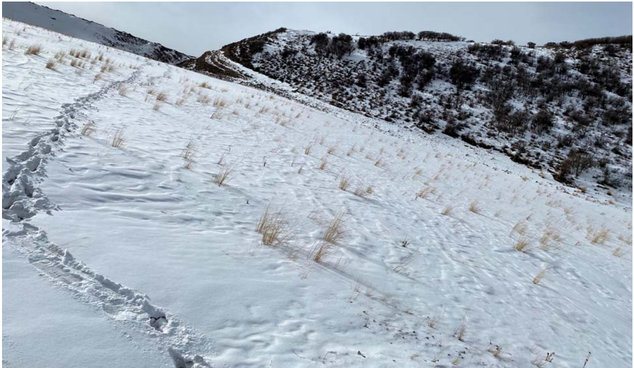
2-01-21 - West Taylor Fill West Flank from monitoring well location