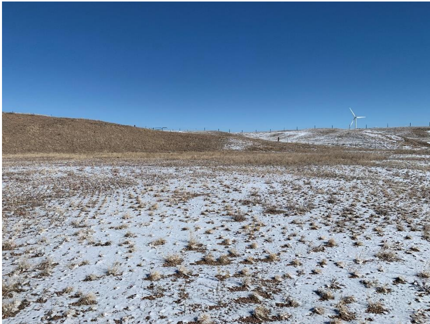
Photo 3 – Pit floor vegetation has filled in compared to previous inspection, facing northeast