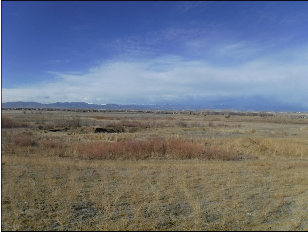
Photo 5: Looking west across permit area, note disturbed areas were done prior to issuance of permit.