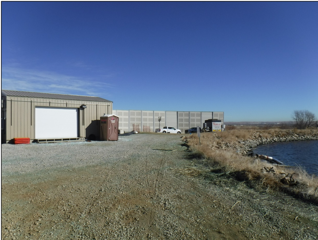
Photo 4: Skid mounted water heater, Signal Reservoir No. 2 to the right of picture