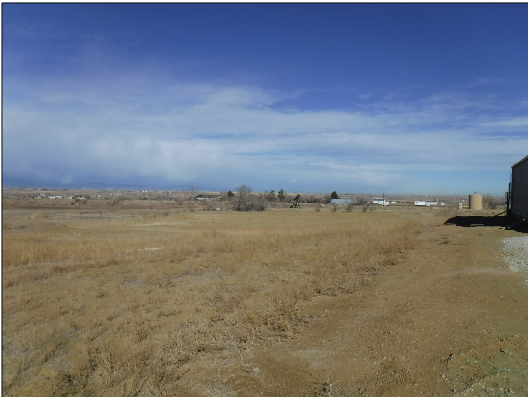
Photo 6: Looking northeast across permit area towards E 168 th Ave.