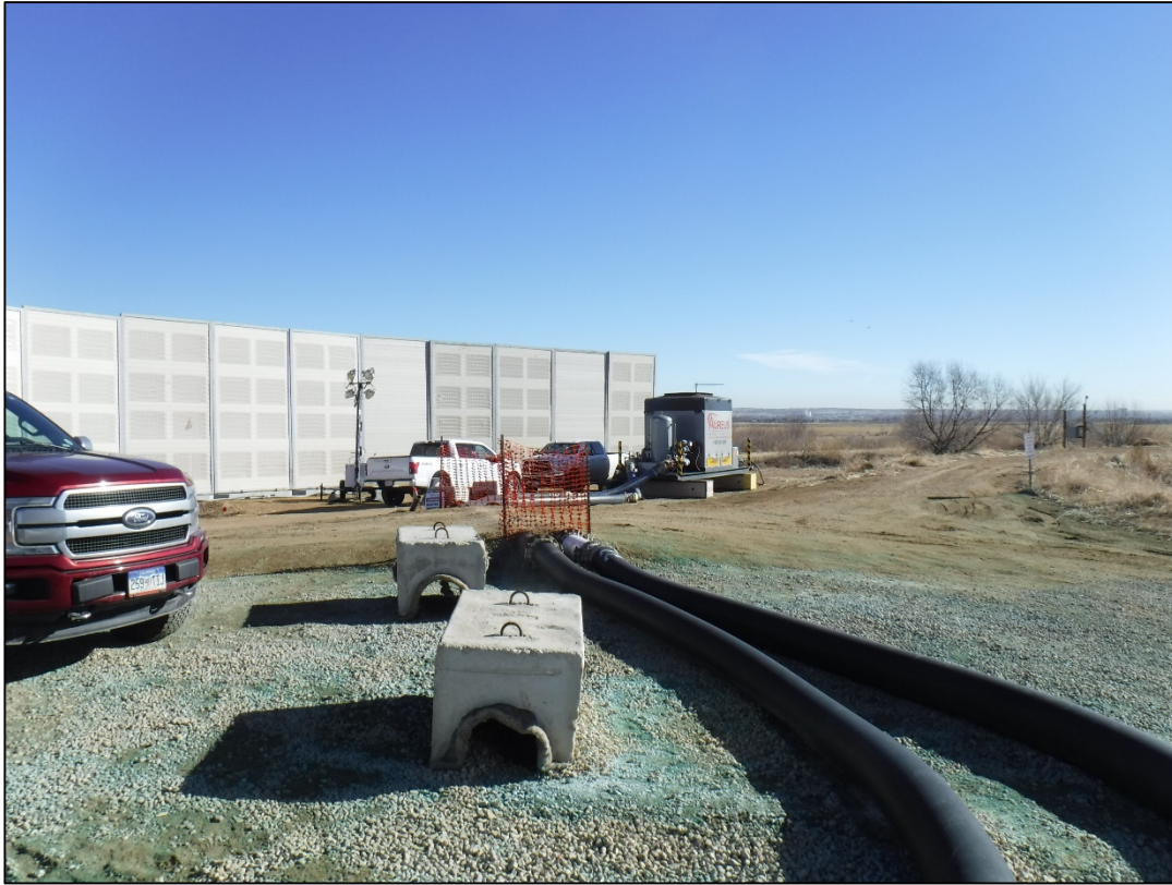
Photo 3: Skid mounted water heater, Signal Reservoir No. 2 to the right out of picture