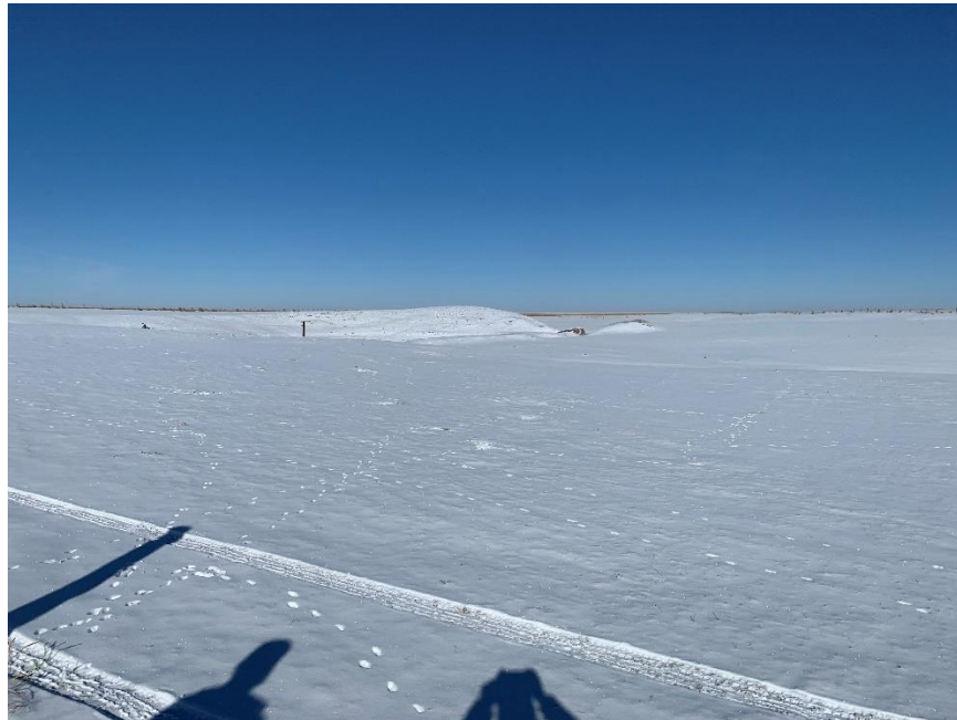
Photo 4 - Pre-existing disturbance outside the western permit boundary