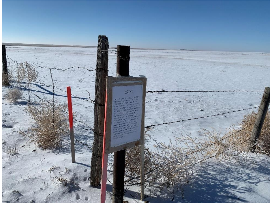
Photo 1 - Public Notice facing CR 10