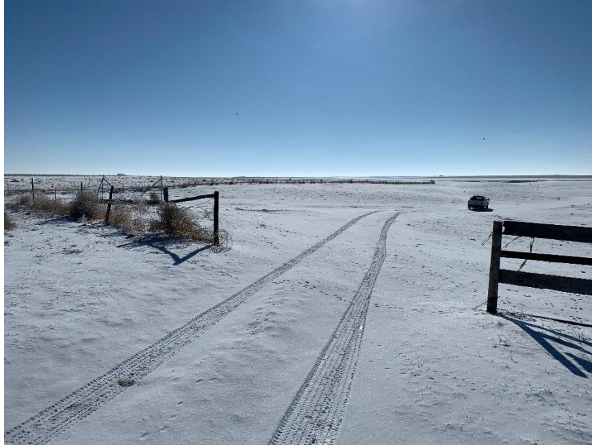
Photo 3 - Unnamed drainage on western boundary facing south from pit access road