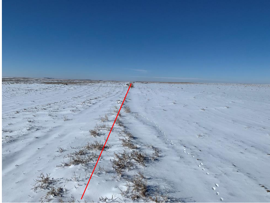
Photo 5 – Southern permit boundary facing west, permitted area on right

Jeff Reeves Logan County 12603 CR 33 Sterling, CO 80751