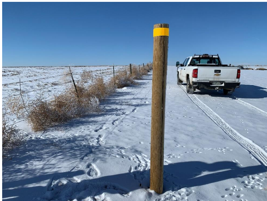
Photo 2 - Boundary marker at south west corner