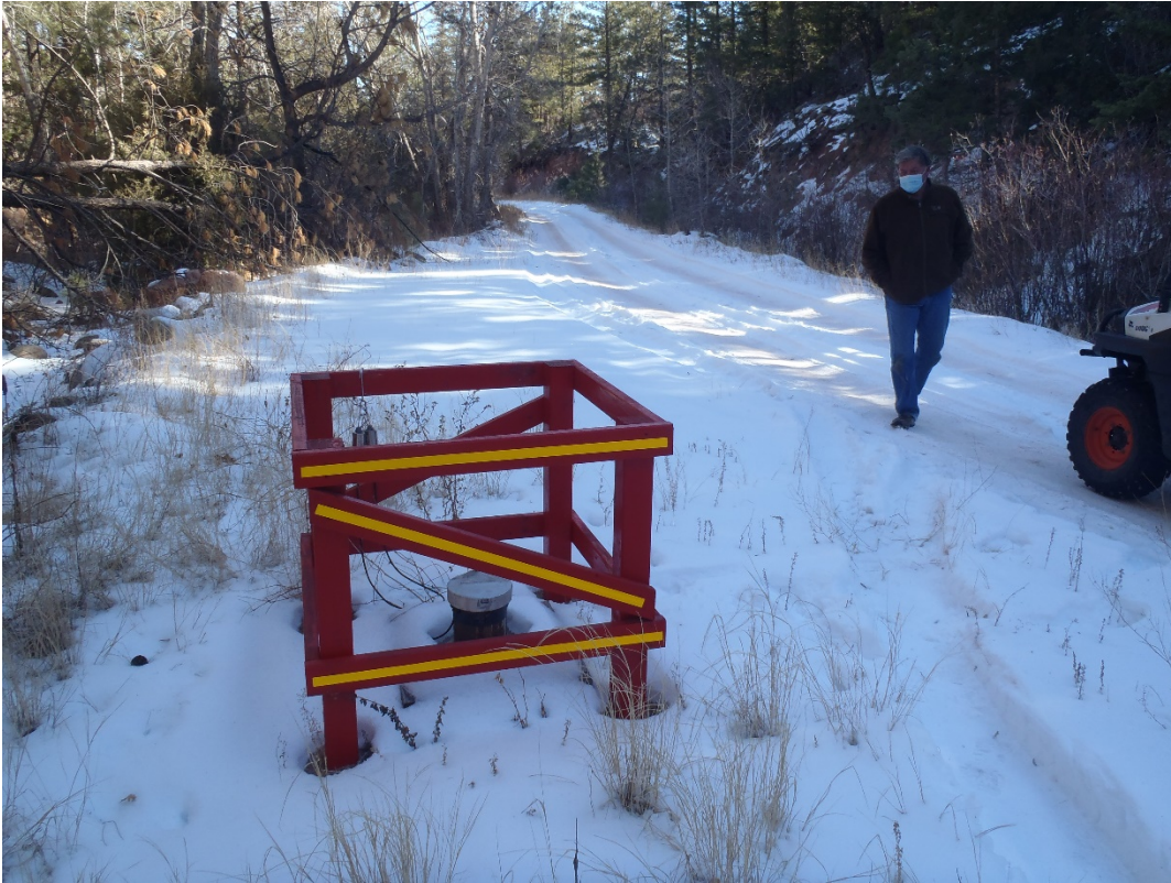
Photo 1. Grasses establishing near LTC-GW-2.