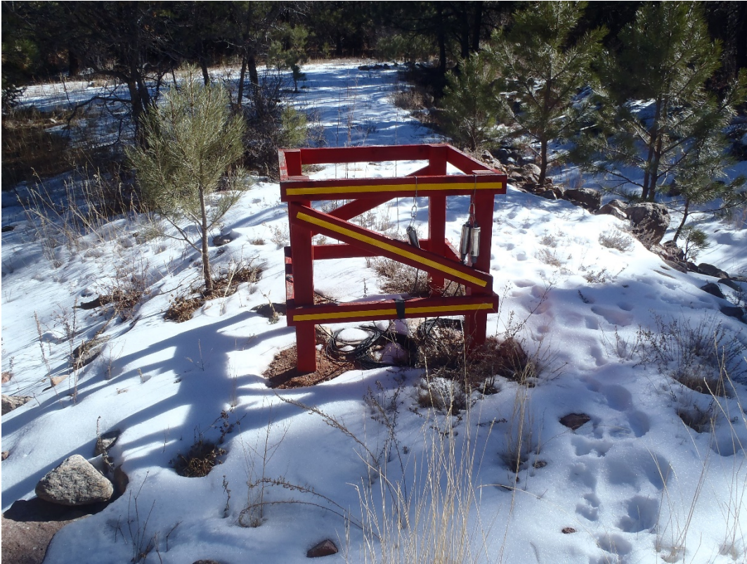
Photo 3. Grasses establishing near LTC-GW-7.