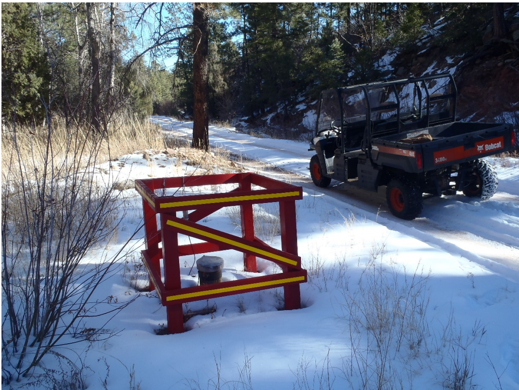
Photo 2. Grasses establishing near LTC-GW-6.