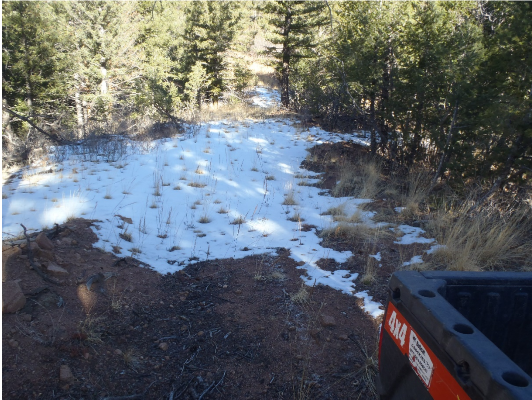
Photo 1. Grasses establishing on access road to B-2.