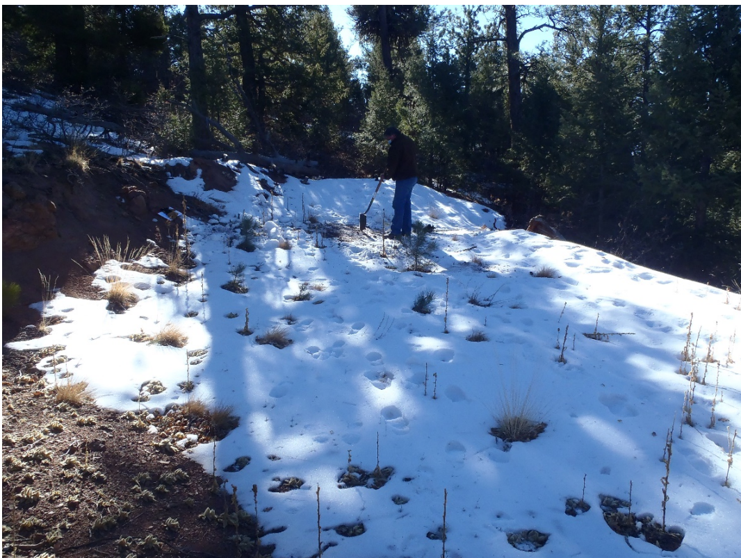
Photo 2. A small amount of mullein near B-4 & HC003-15.