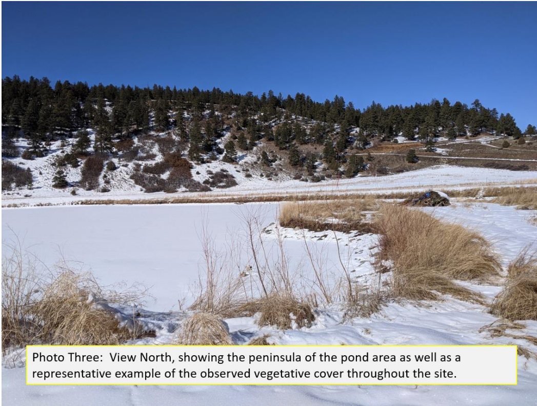
Photo Three: View North, showing the peninsula of the pond area as well as a representative example of the observed vegetative cover throughout the site.