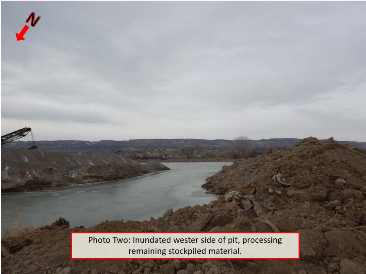
Photo Two: Inundated western side of pit, processing remaining stockpiled material.