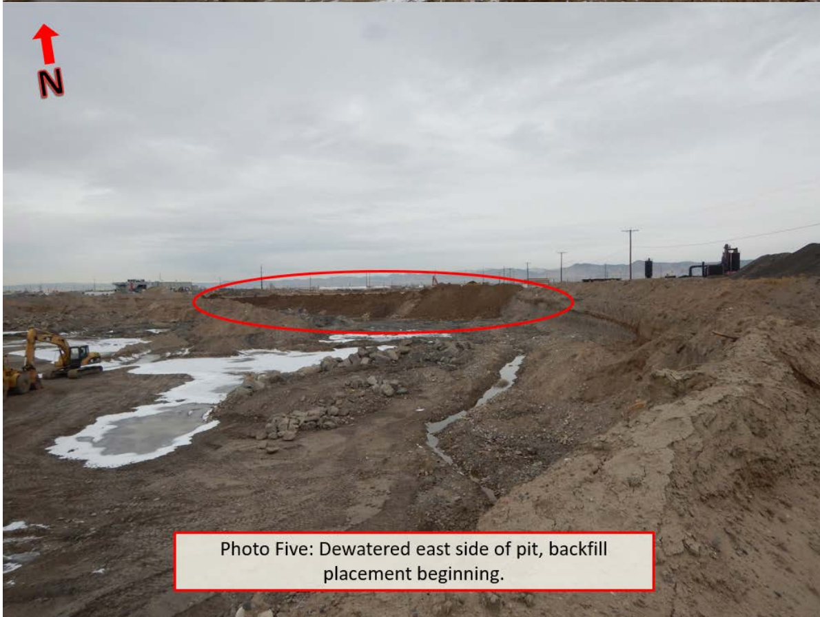
Photo Five: Dewatered east side of pit, backfill placement beginning.