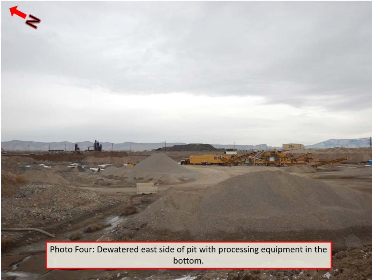
Photo Four: Dewatered east side of pit with processing equipment in the bottom.