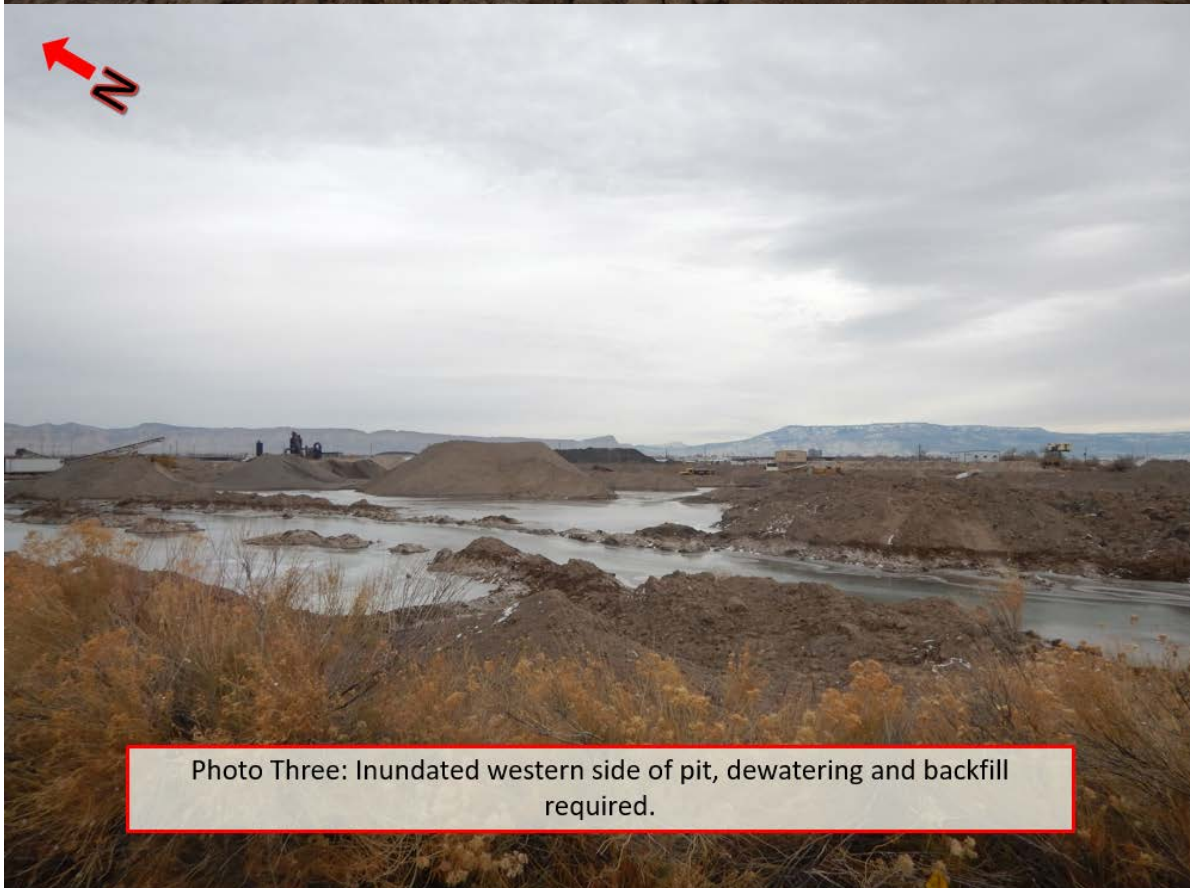
Photo Three: Inundated western side of pit, dewatering and backfill required.