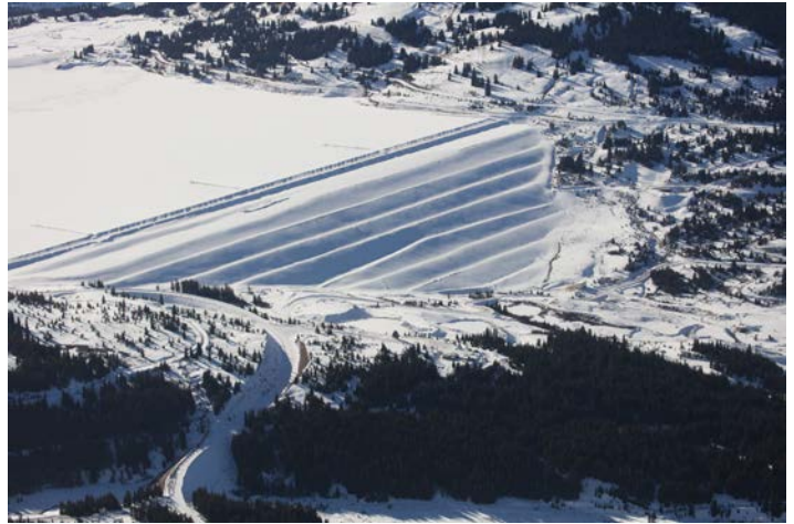
Tenmile Pond-3 Dam