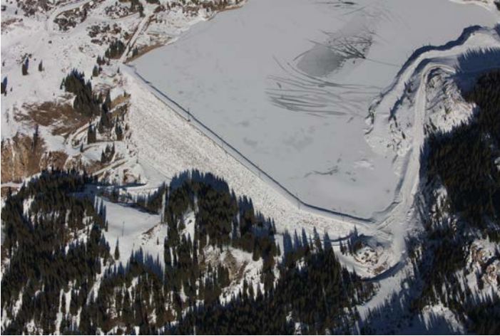
Eagle Park Reservoir-4 Dam

The McNulty and North 40 OSF's were observed. Snow cover on the OSF's appeared to range from approximately one foot on north and west facing slopes, to no snow cover on south facing slopes. The current OSF operating plan was drafted by Golder Associates in December 2016. The plan was submitted to the Division as part of TR-25. Climax appears to be in compliance with Golder recommendations for OSF operations. No problems were noted with the OSF's.