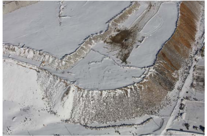
North 40 OSF

No problems or violations were noted during this inspection.