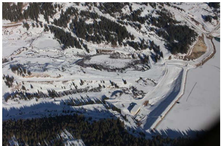
Robinson Lake Dam