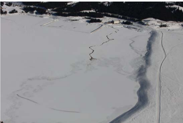
2 Dam – Tenmile Pond