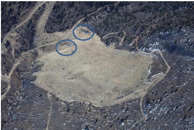
West Mine (ponds are circled)

Number of Partial Inspection this Fiscal Year: 4