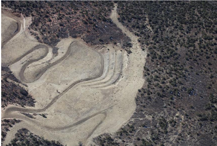
East Mine – upper portion