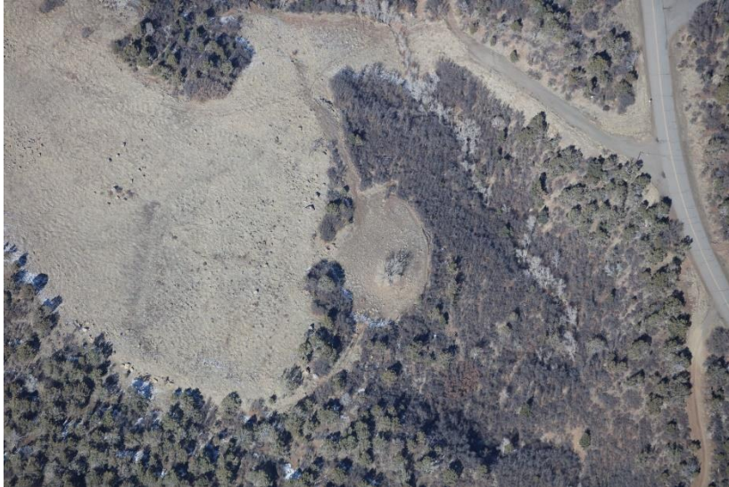
R.O.M. Storage Area and reclaimed pond