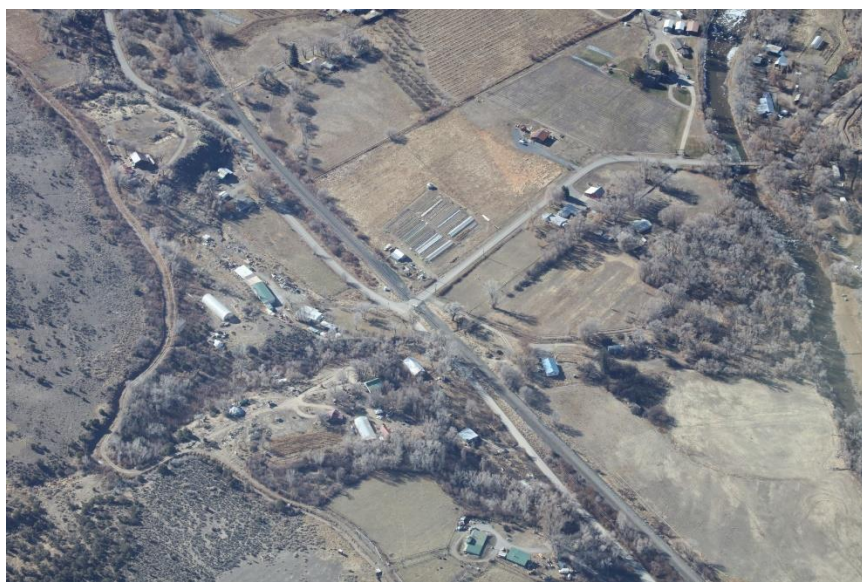
Loadout (portion along UPRR tracks)

Number of Partial Inspection this Fiscal Year: 4