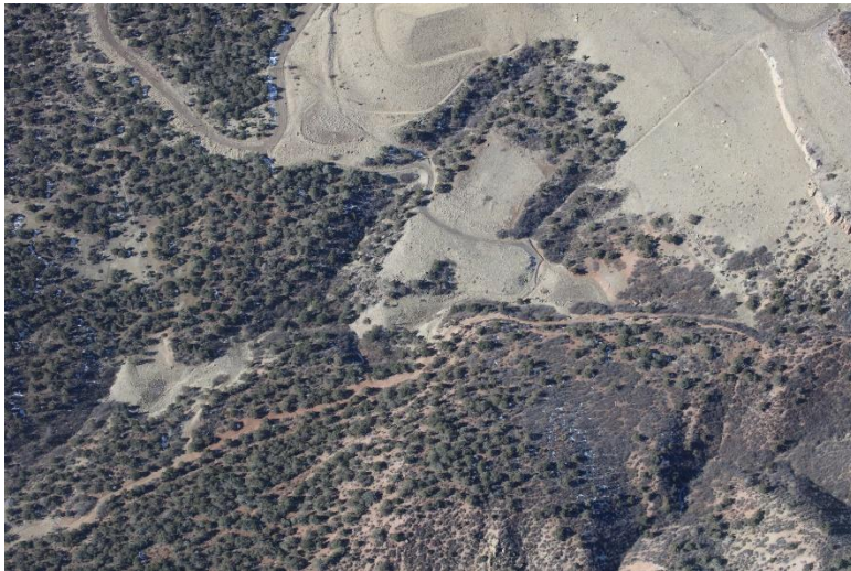
East Mine – Reclaimed ponds, Old Waste Disposal Area, and RDA

Number of Partial Inspection this Fiscal Year: 4