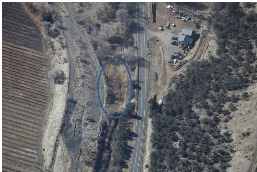
Loadout (pond is circled)