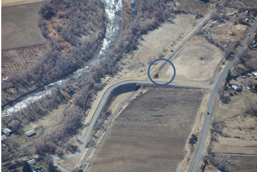
Former Coal Storage by highway and Black Bridge Road (pond is circled)