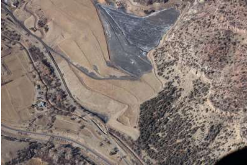
Gob Pile #2