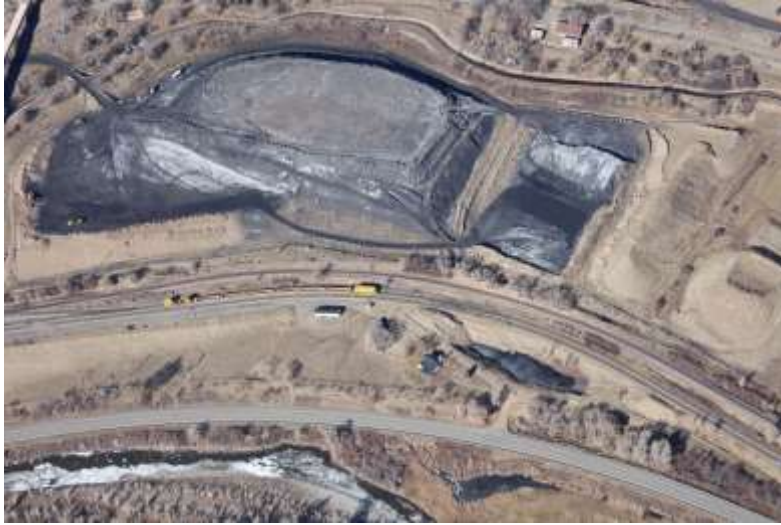
Gob Pile #3