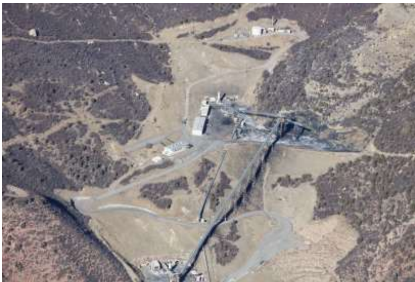
D Portal area and Utility Bench

Number of Partial Inspection this Fiscal Year: 4