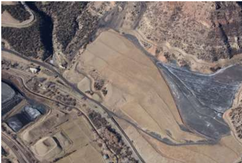
Gob Piles #1 and #4

Number of Partial Inspection this Fiscal Year: 4