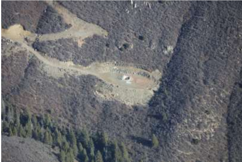
Pad for Terror Creek Vent Shaft