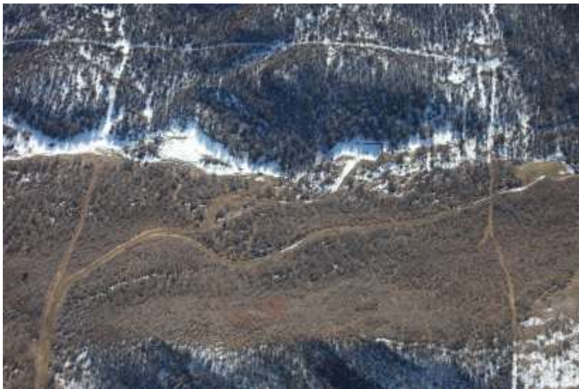
Gob vent boreholes (B17)

Number of Partial Inspection this Fiscal Year: 4