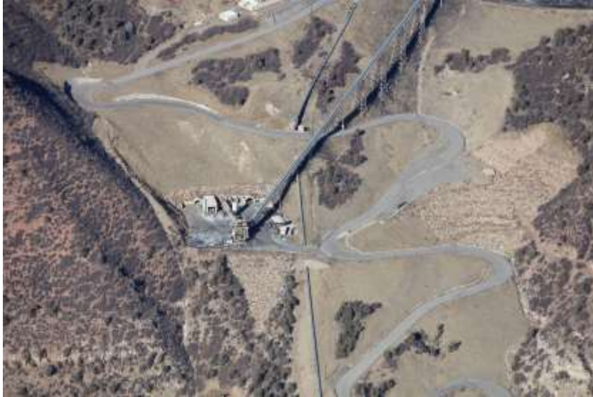
B Portal area