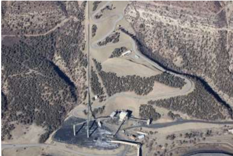
Coal Stockpile and lower Haul Road

Number of Partial Inspection this Fiscal Year: 4