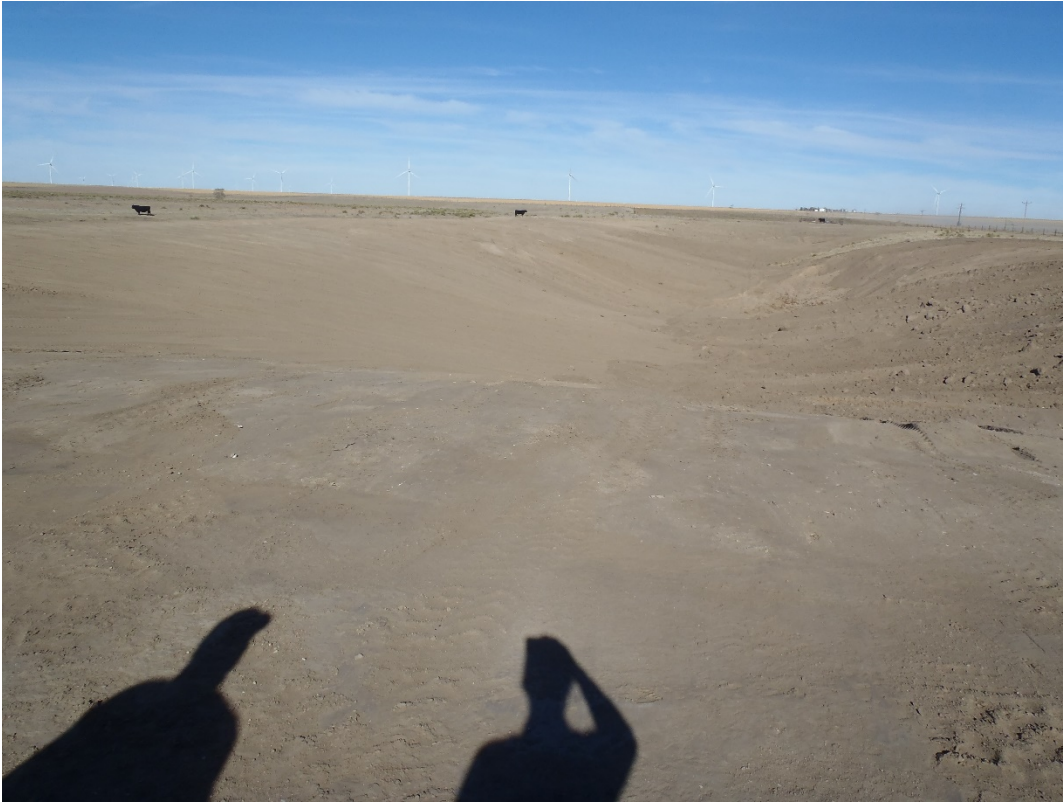
Photo 1. Regraded portion near 3H:1V on left, incomplete grading on right (looking north).