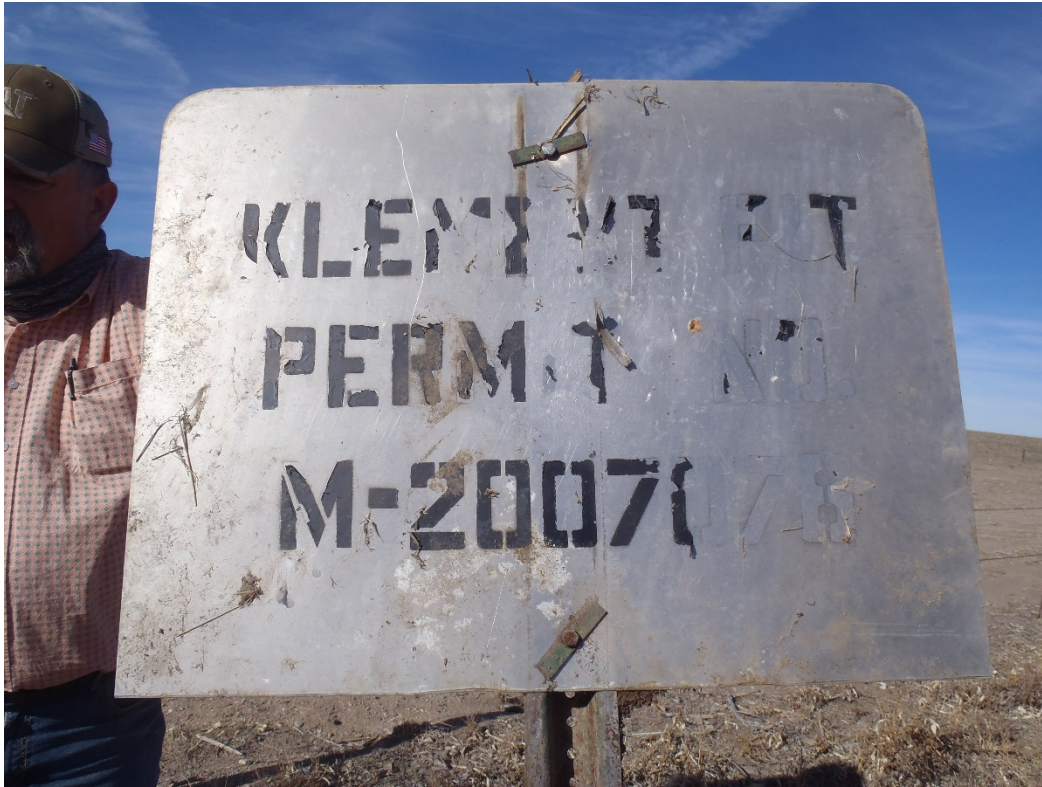
Photo 5. Permit sign needing repair.