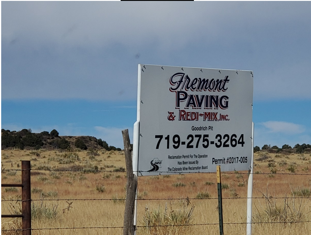
Mine site Entrance