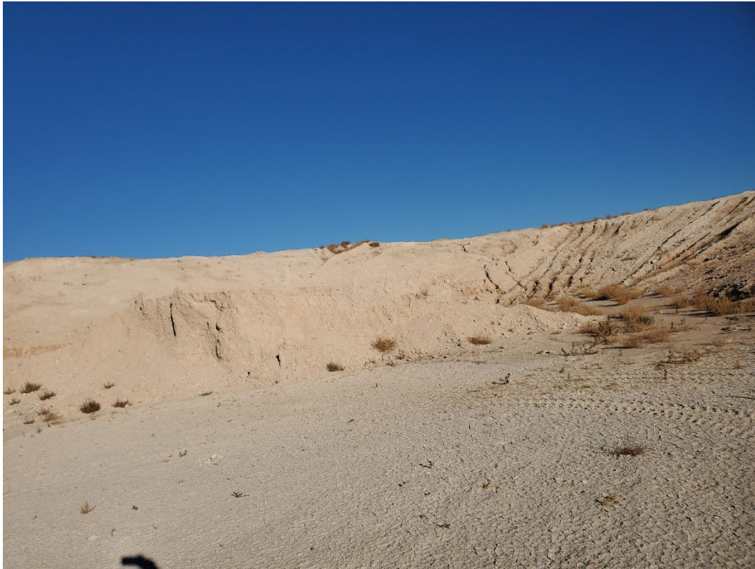
East end of Permit