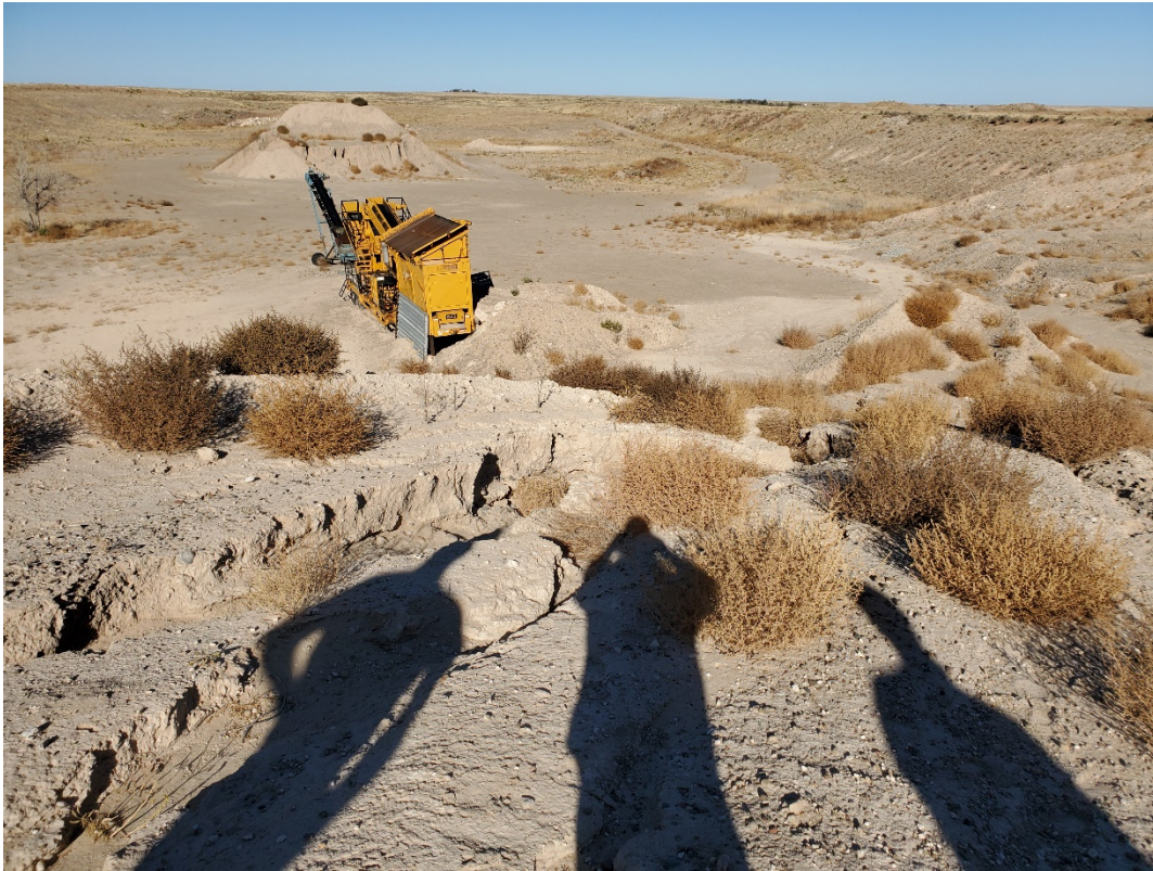
Erosional issue that needs to be fixed