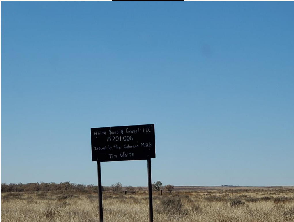
Mine site entrance missing the number 2