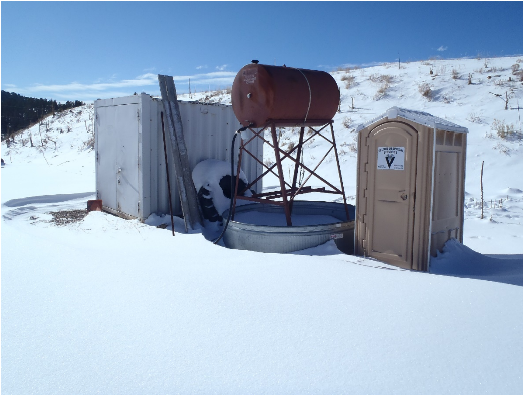
Photo 3. Empty AST with secondary containment and portable storage shed. (west side, looking SW).