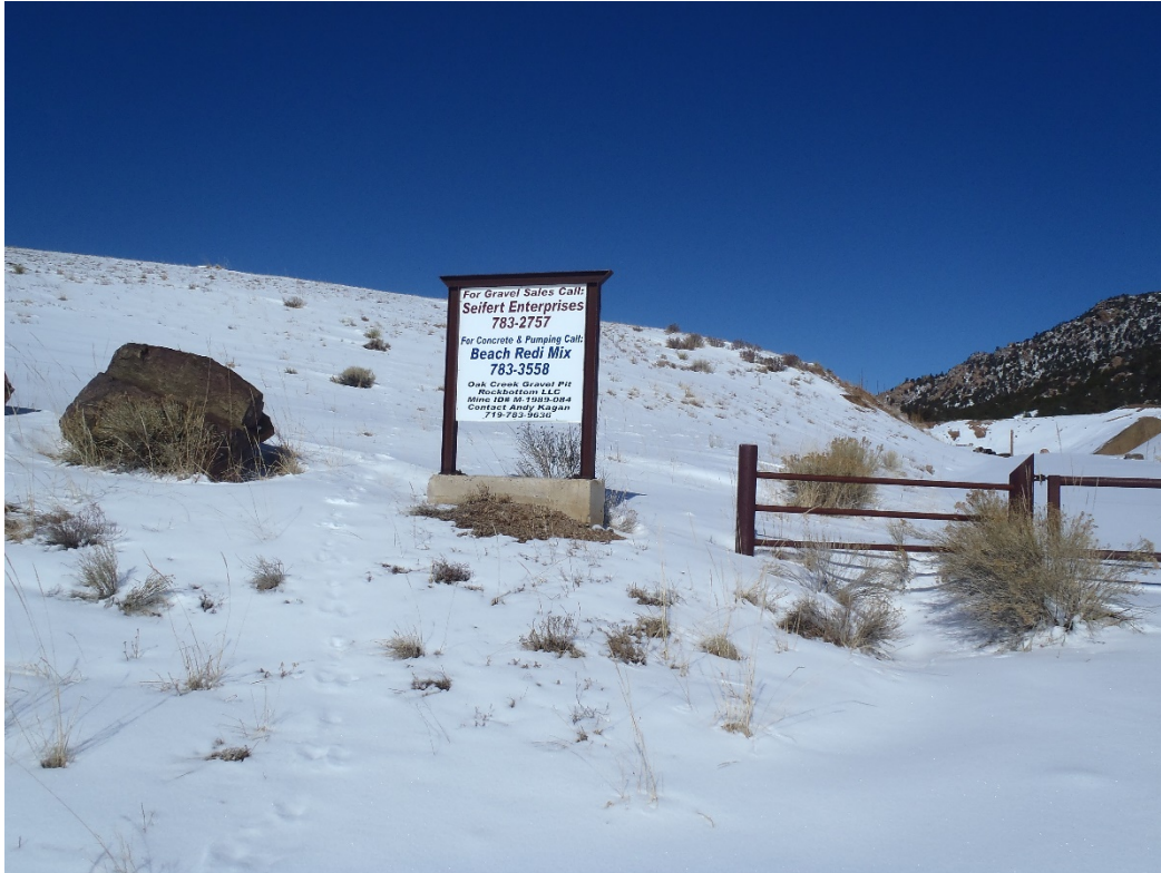
Photo 5. Permit sign at entrance off CR 143.