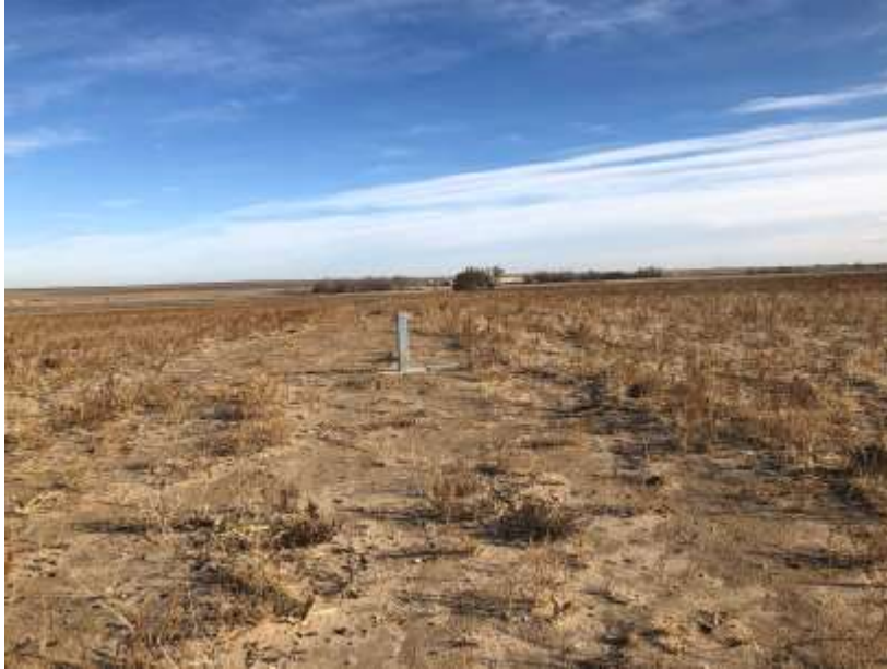
North end of reclaimed spoil area (looking east)