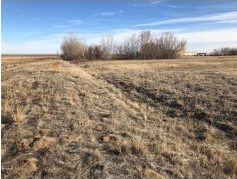
Looking east at Sediment Pond 2, with drainage ditch in foreground