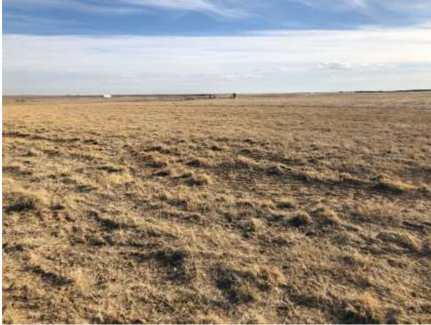
Looking south at reclaimed parcels