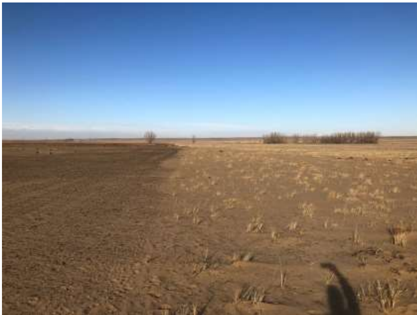
Reclaimed spoil area on left and Parcel 25 on the right (tree clump in back is at Sediment Pond 2)

Number of Partial Inspection this Fiscal Year: 3