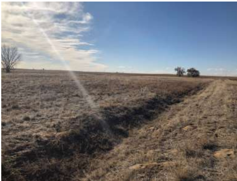
East side of Parcel 42, looking west

Number of Partial Inspection this Fiscal Year: 3