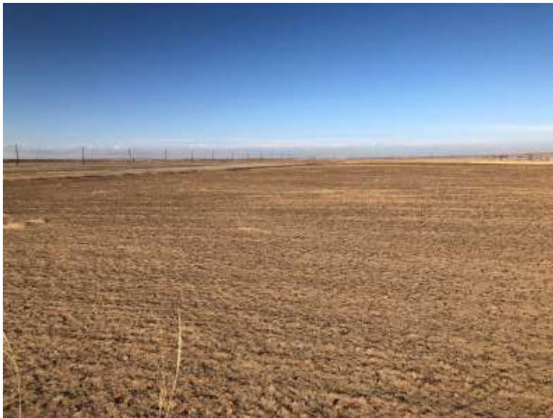
Reclaimed B Pit, looking northwest

Number of Partial Inspection this Fiscal Year: 3