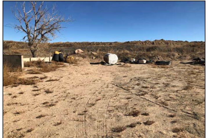
Photo 2 – Trash in NW area of site that will need to be removed and disposed of properly.