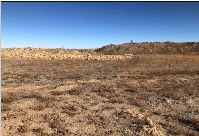
Photo 5 – Additional overburden and concrete that will need to be removed from NW area of permit.