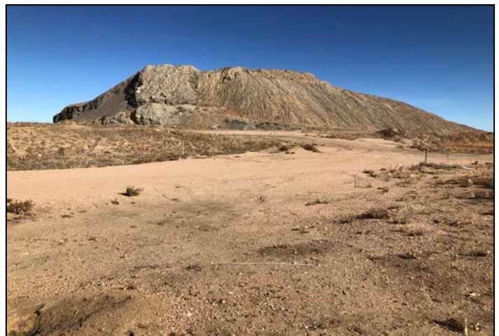
Photo 4 – Large stockpile of overburden (shale) in NW area of site that will need to be removed from the site prior to revegetation.