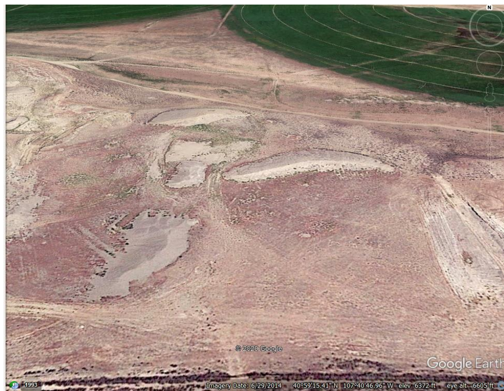
Photo 2: The middle portion of the permit area containing the stockpiles.