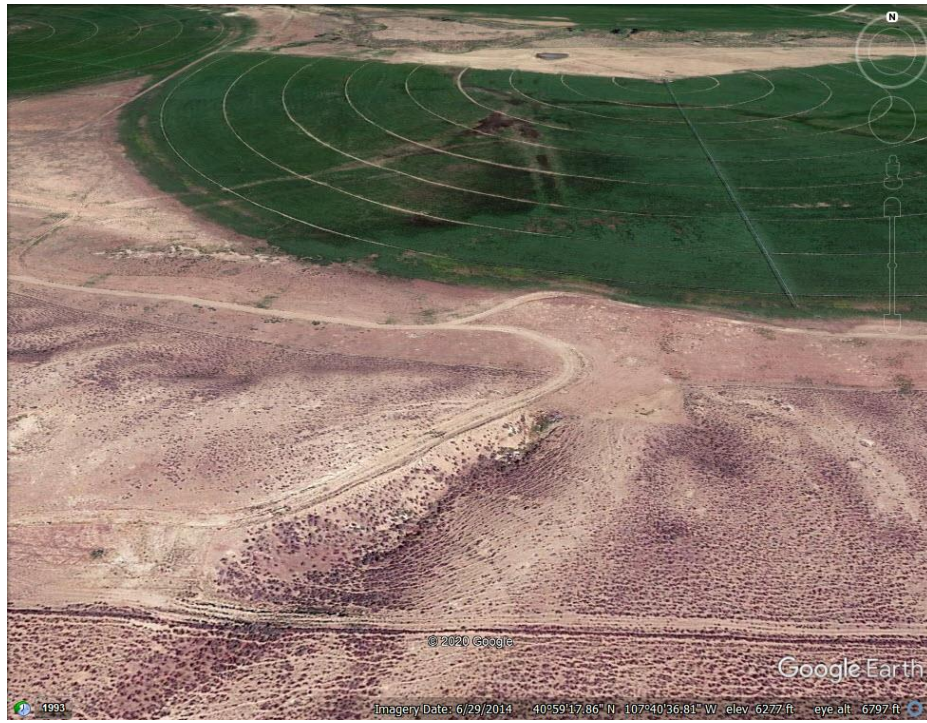
Photo 3: The eastern portion of the permitted area is undisturbed.