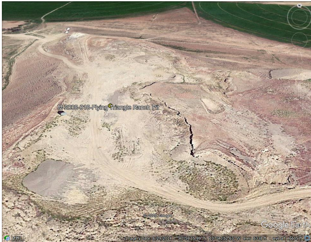
Photo 1: The western portion of the permitted area containing the mine pit.