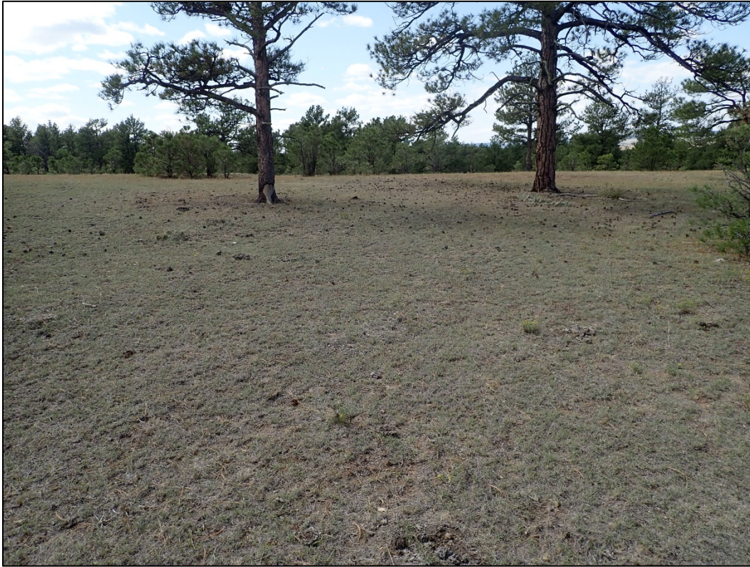
Photo 5. Sample photo of adjacent undisturbed lands; looking east.

Richard Murphy The Denver Brick Company 210 Acme St Denton, TX 76205