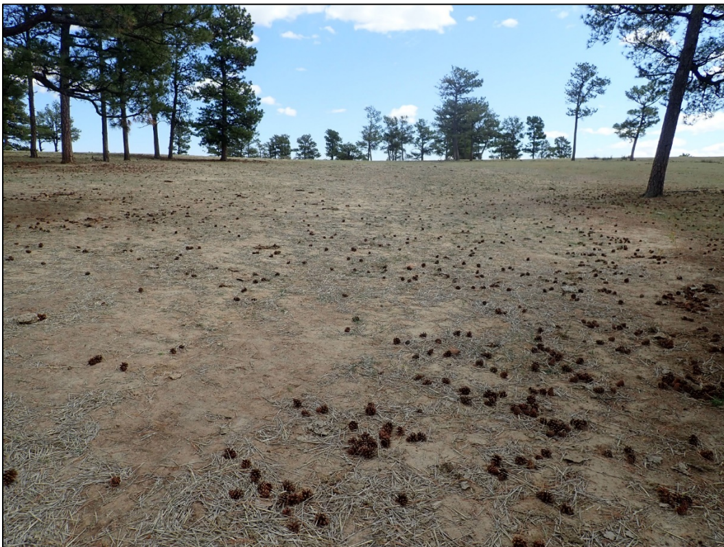
Photo 4. Sample photo of the reclaimed test trench; looking southeast.