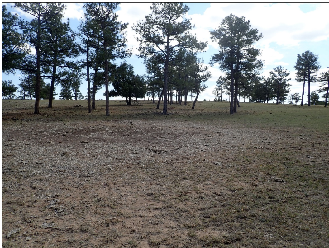
Photo 2. Sample photo of the reclaimed test trench; looking southwest.