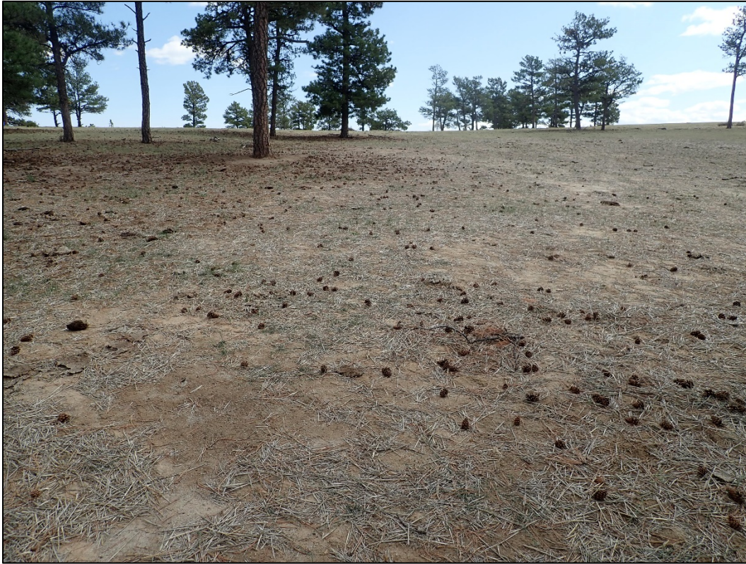
Photo 3. Sample photo of the reclaimed test trench; looking south.