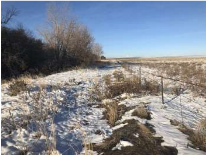
Sediment Pond 2 – north side

No enforcement actions were initiated as a result of this inspection, nor are any pending.