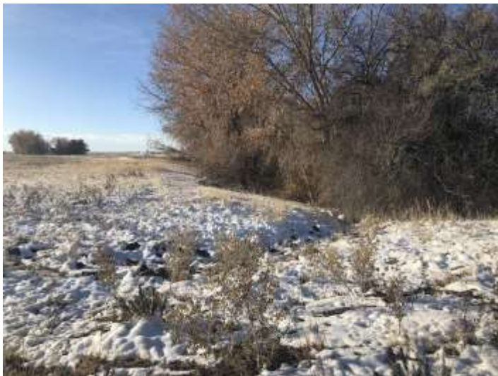
Sediment Pond 2 – east side

Number of Partial Inspection this Fiscal Year: 3