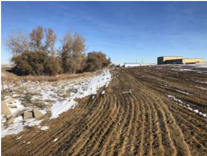
Reclaimed topsoil area and south end of Dugout Pond (Facility area is in background on right)

Number of Partial Inspection this Fiscal Year: 3