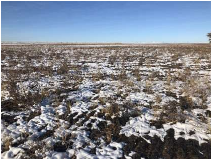
Reclaimed Long Term Spoil area with weeds (possibly Kochia)

Number of Partial Inspection this Fiscal Year: 3