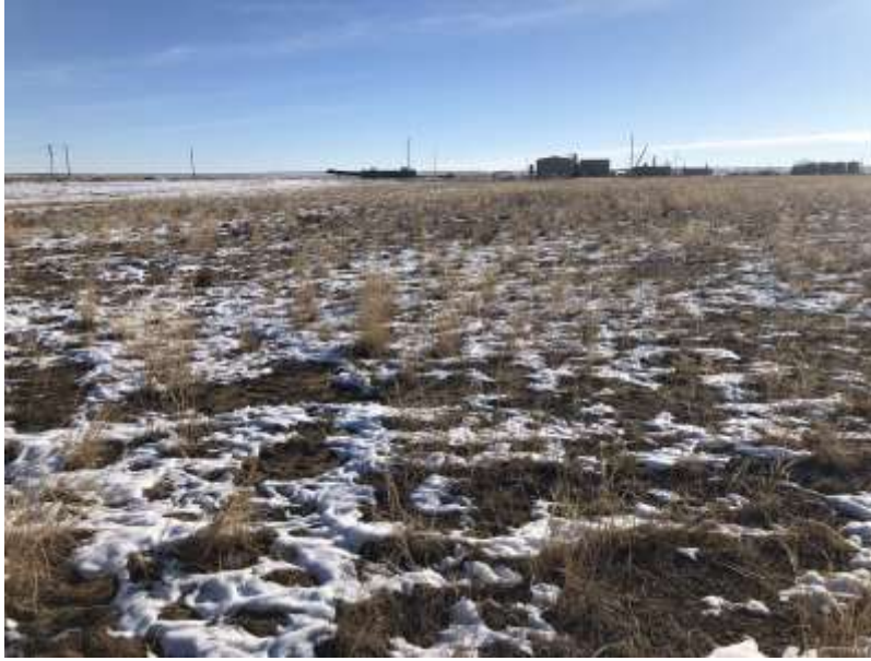
Parcel 34 (buildings in background are off of permit)