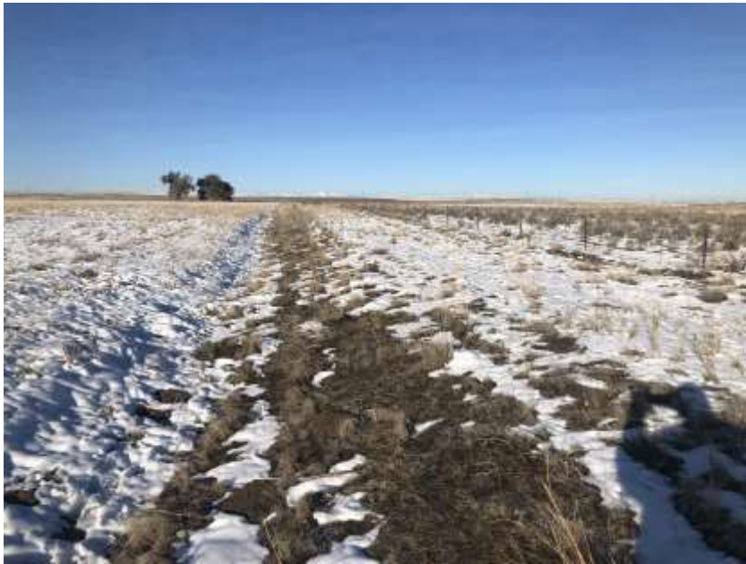
Ditch along north side of site