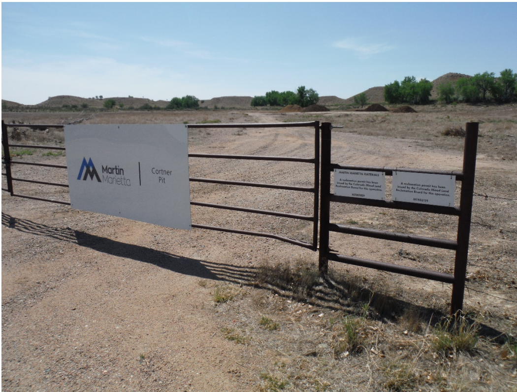
Photo 1. Mine identification sign along Cortner Road; looking southeast.