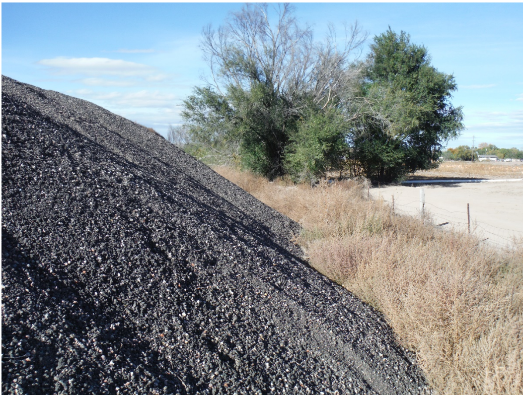
Photo 4. CN-01 proposed eastern permit boundary, northern portion; looking north.