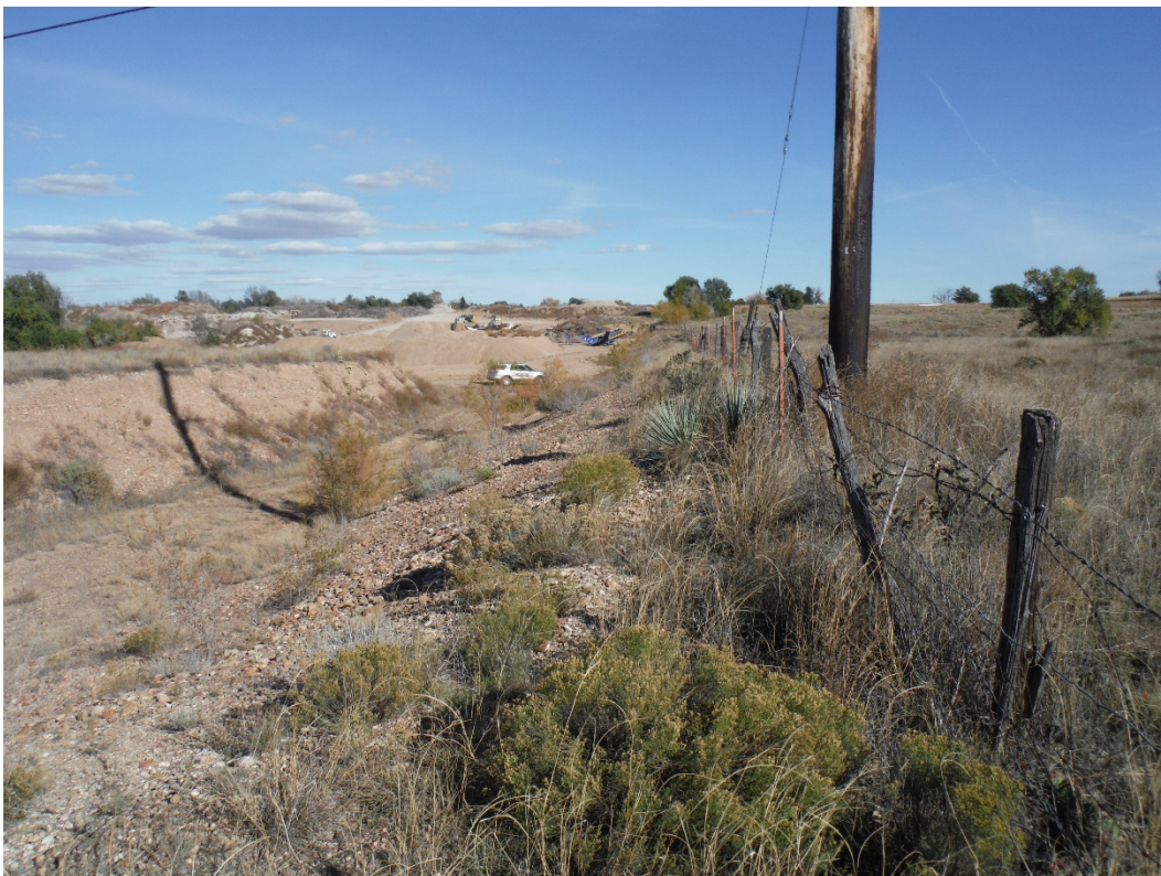
Photo 2. Southern permit boundary; looking east near the southwest permit boundary corner.