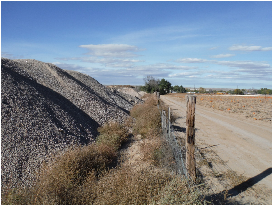
Photo 3. CN-01 proposed eastern permit boundary, southern portion; looking north.