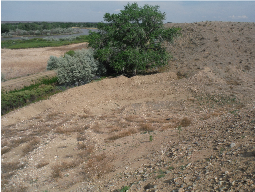
Photo 5. Stormwater containment berm located along eastern permit boundary; looking east.

Daniel J. Gaudreault and Barbara J. Gaudreault PO Box 1474 Elizabeth, CO 81007