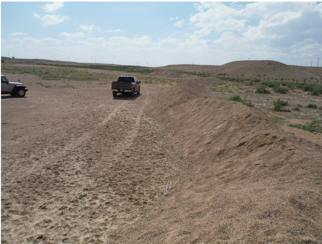
Photo 4. Stormwater containment berm located in northern portion of the permit; looking west.