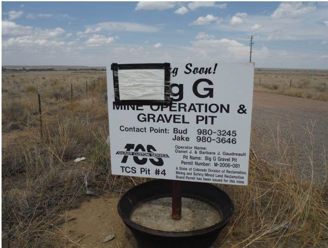
Photo 1. Mine identification sign and AM-01 notice; looking northeast.