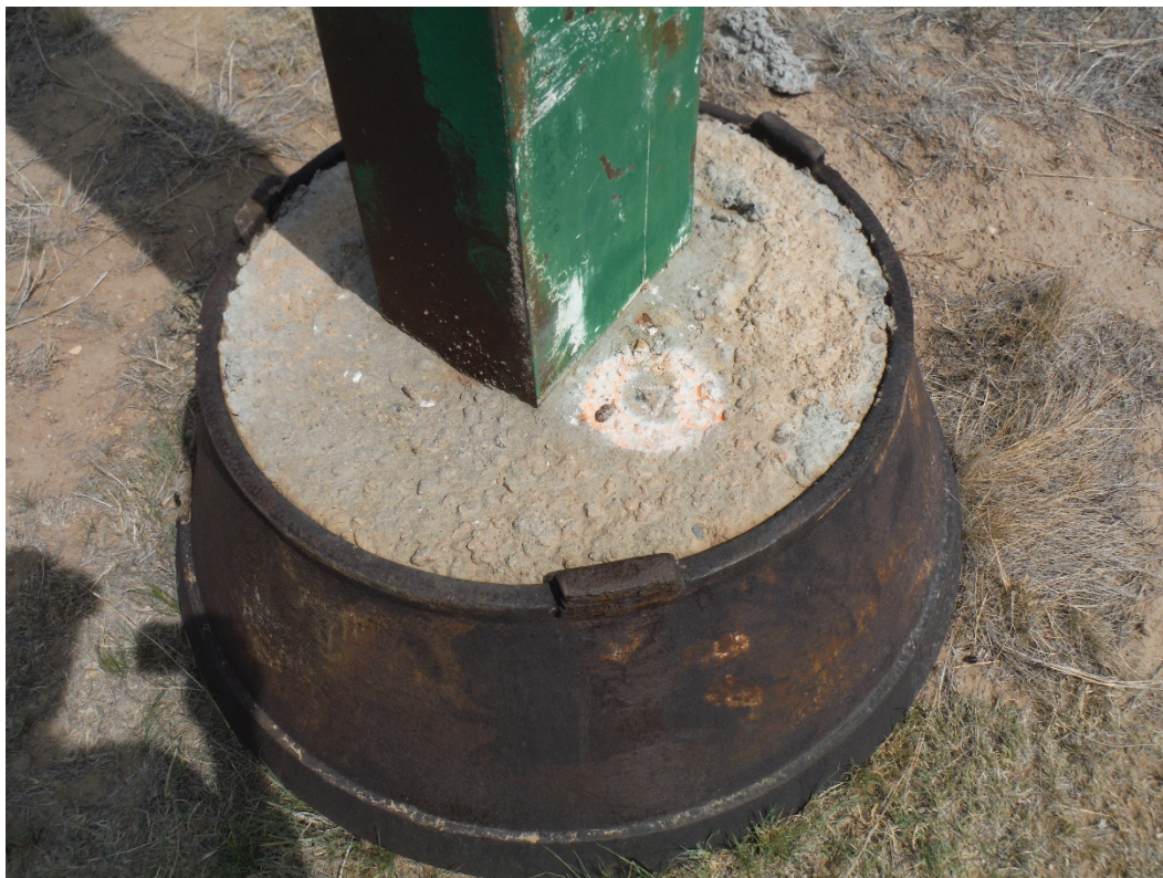
Photo 2. New permit boundary marker near access road; looking east.