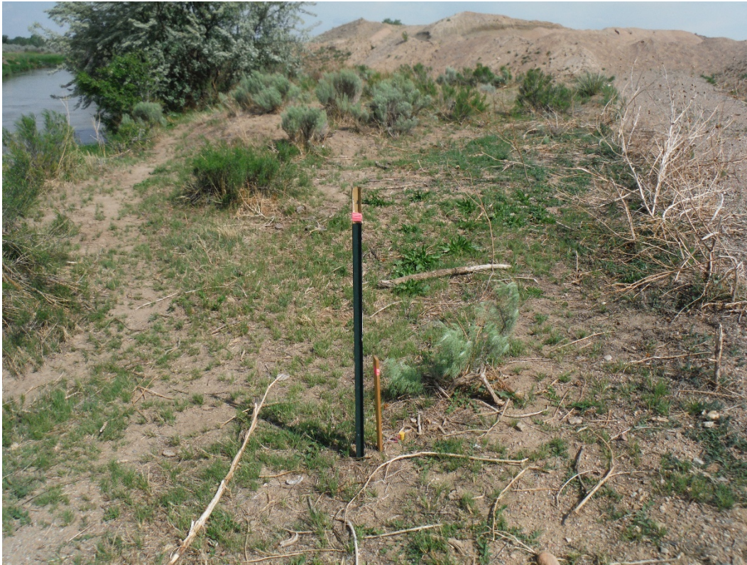
Photo 3. New permit boundary marker in the northern portion of the permit between the current processing area and Highline Canal; looking southeast.