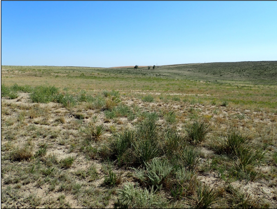
Photo 3. Sample photo of the reclaimed affected lands; looking south.

Ralph Bell Castle Rock Construction Company of Colorado, LLC 6374 S. Racine Circle Centennial, CO 80111