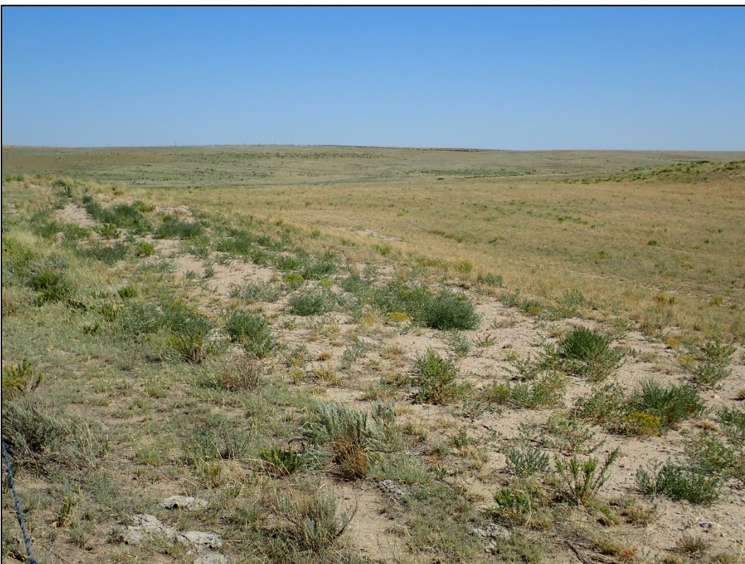
Photo 2. Sample photo of the reclaimed affected lands; looking southeast.