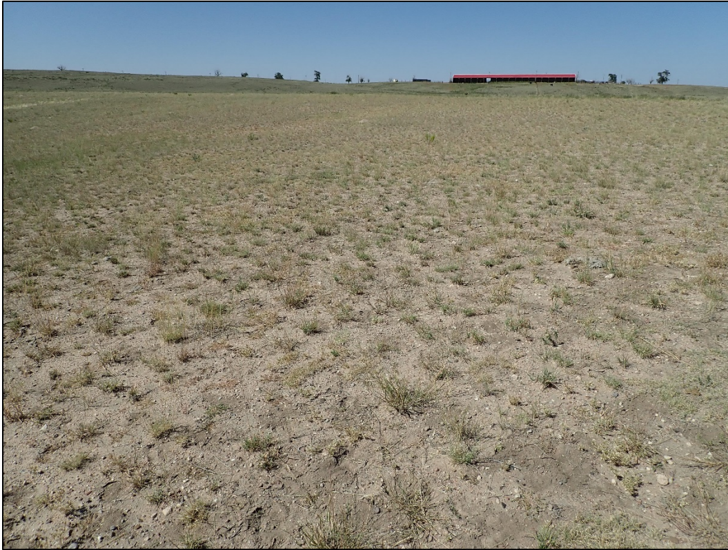
Photo 3. Sample photo of the reclaimed affected lands; looking northwest.