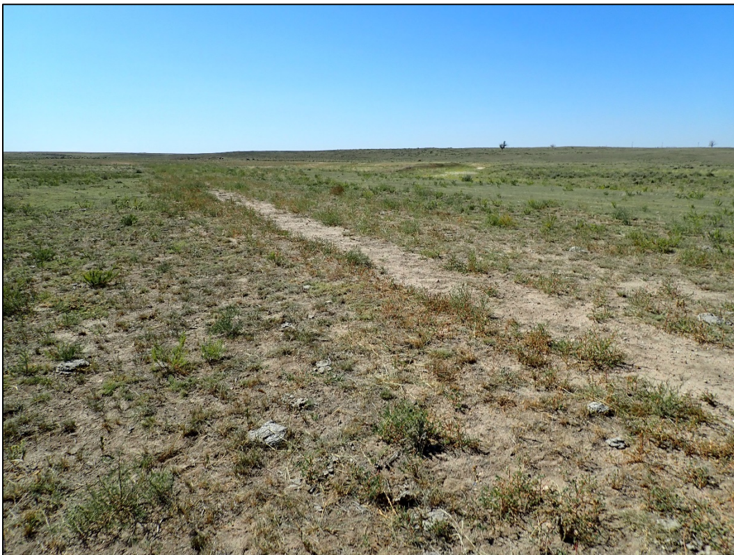
Photo 4. Sample photo of the reclaimed access road; looking southwest.