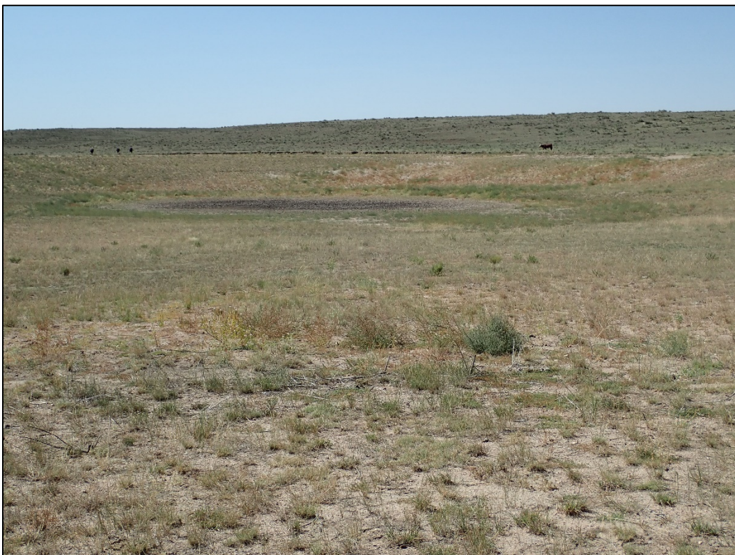
Photo 2. Sample photo of the reclaimed affected lands; looking west.