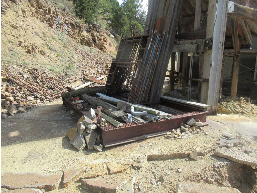
View of the Franklin Shaft