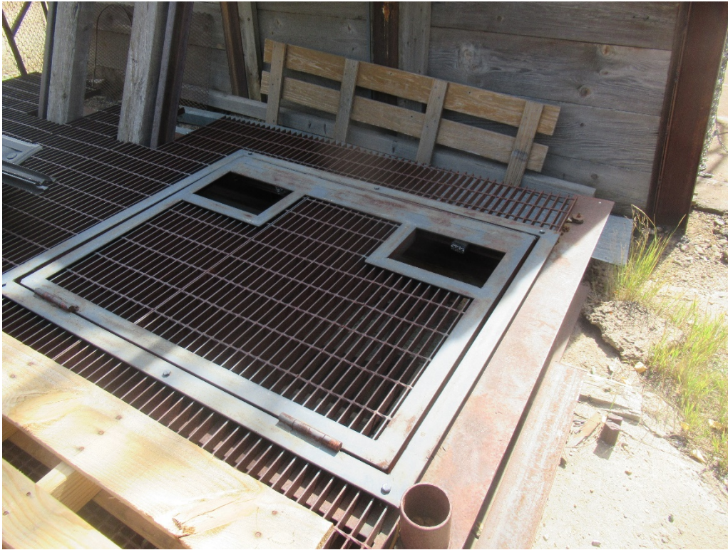
View of the Freighter's Friend Shaft