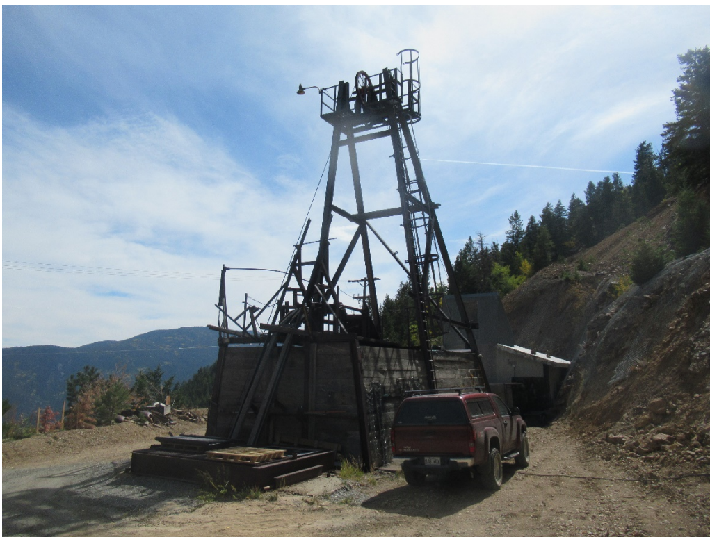
View of the Freighter's Friend Shaft