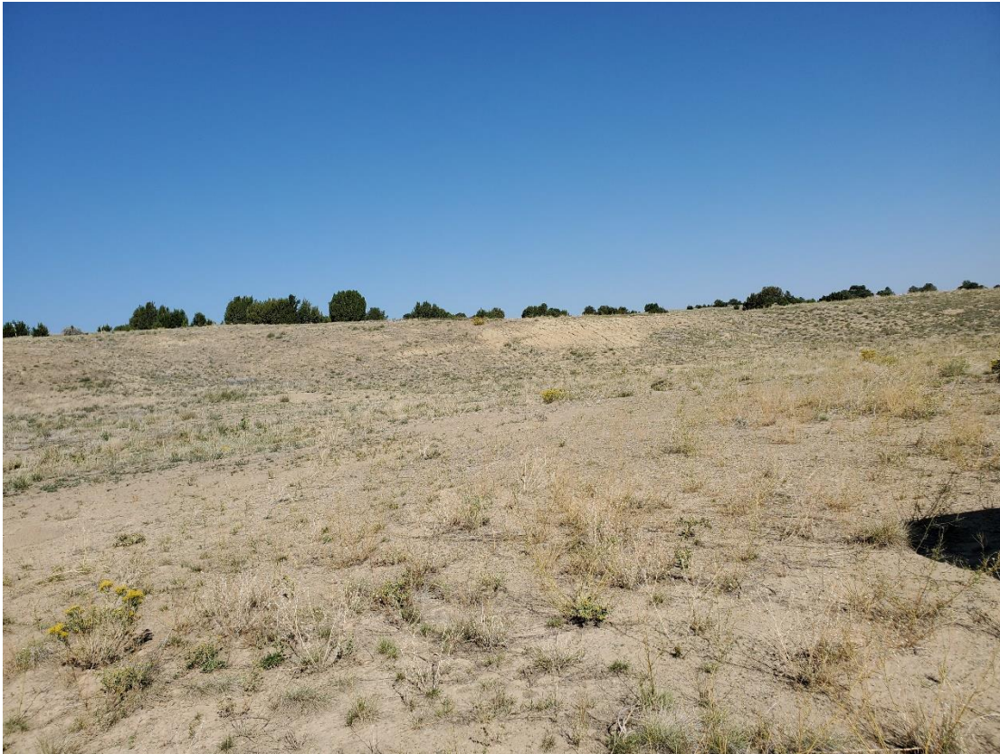
3 Acres that need a little more Vegetation