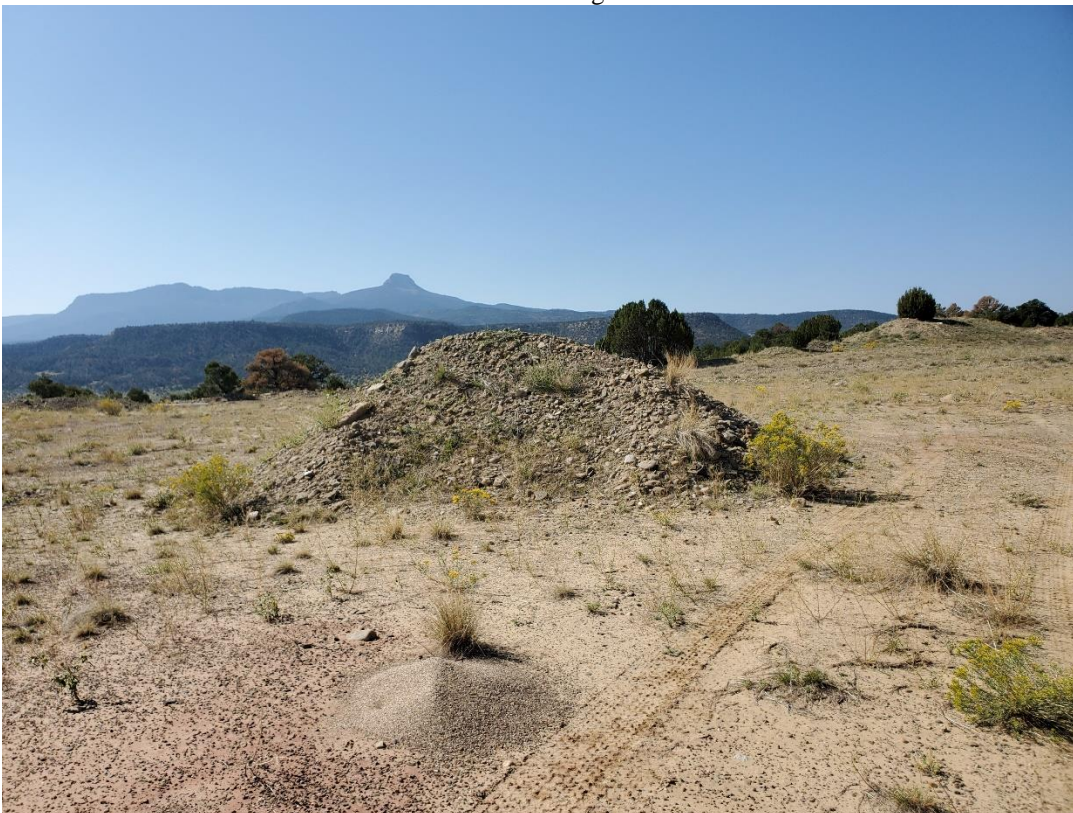
Stockpile for Road Maintenance