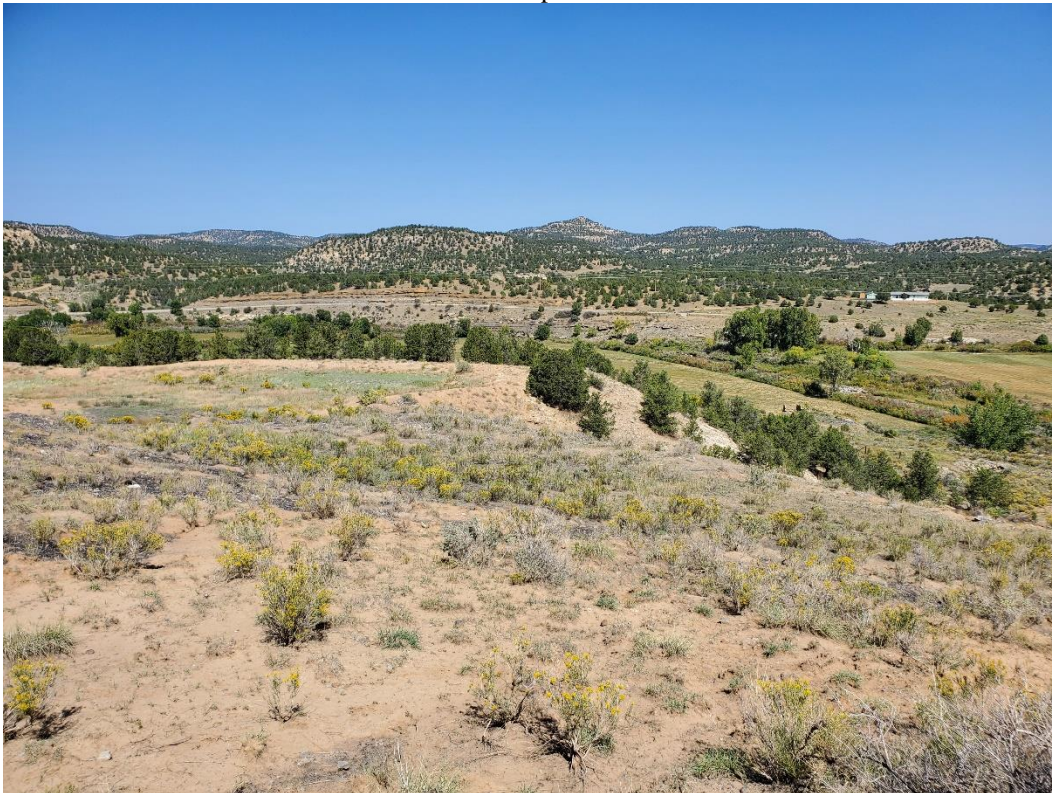
Natural vegetation on the Permit