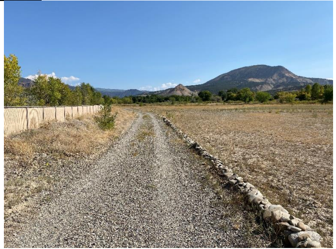
Road to remain- final rec plan