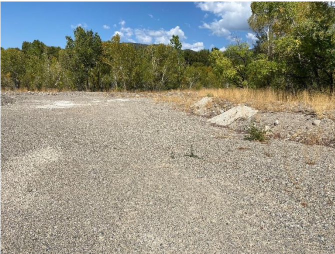
TR 04 Approved parking lot